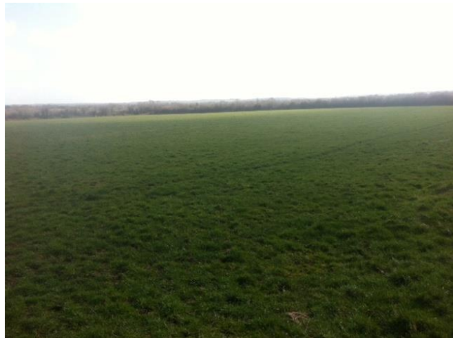
Lands at Ullid. Kilmacow. Co. Kilkenny.