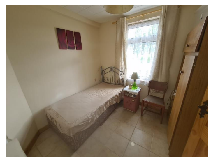
Family Room / Optional Ground Floor Bedroom