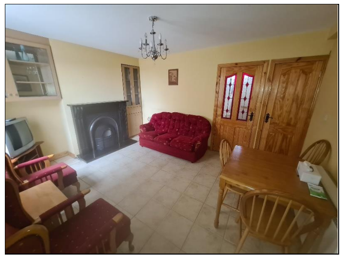
Living / Dining Room