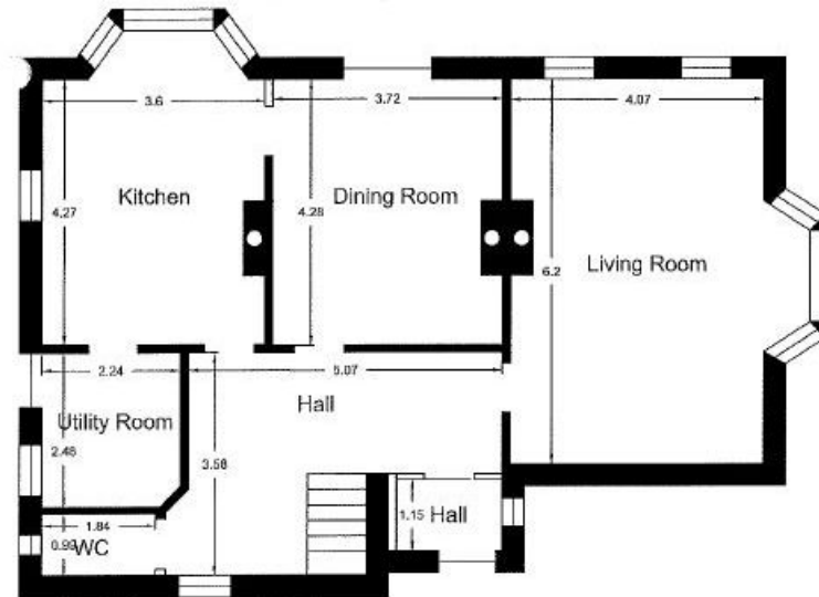
Ground Floor Area 87.61