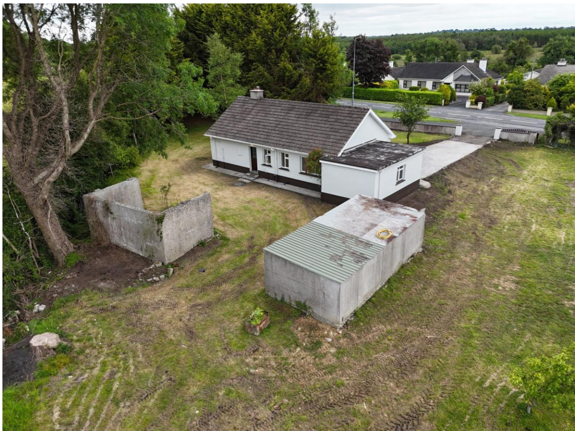
Clonboney, Lanesborough, Co. Longford. N39 HR84