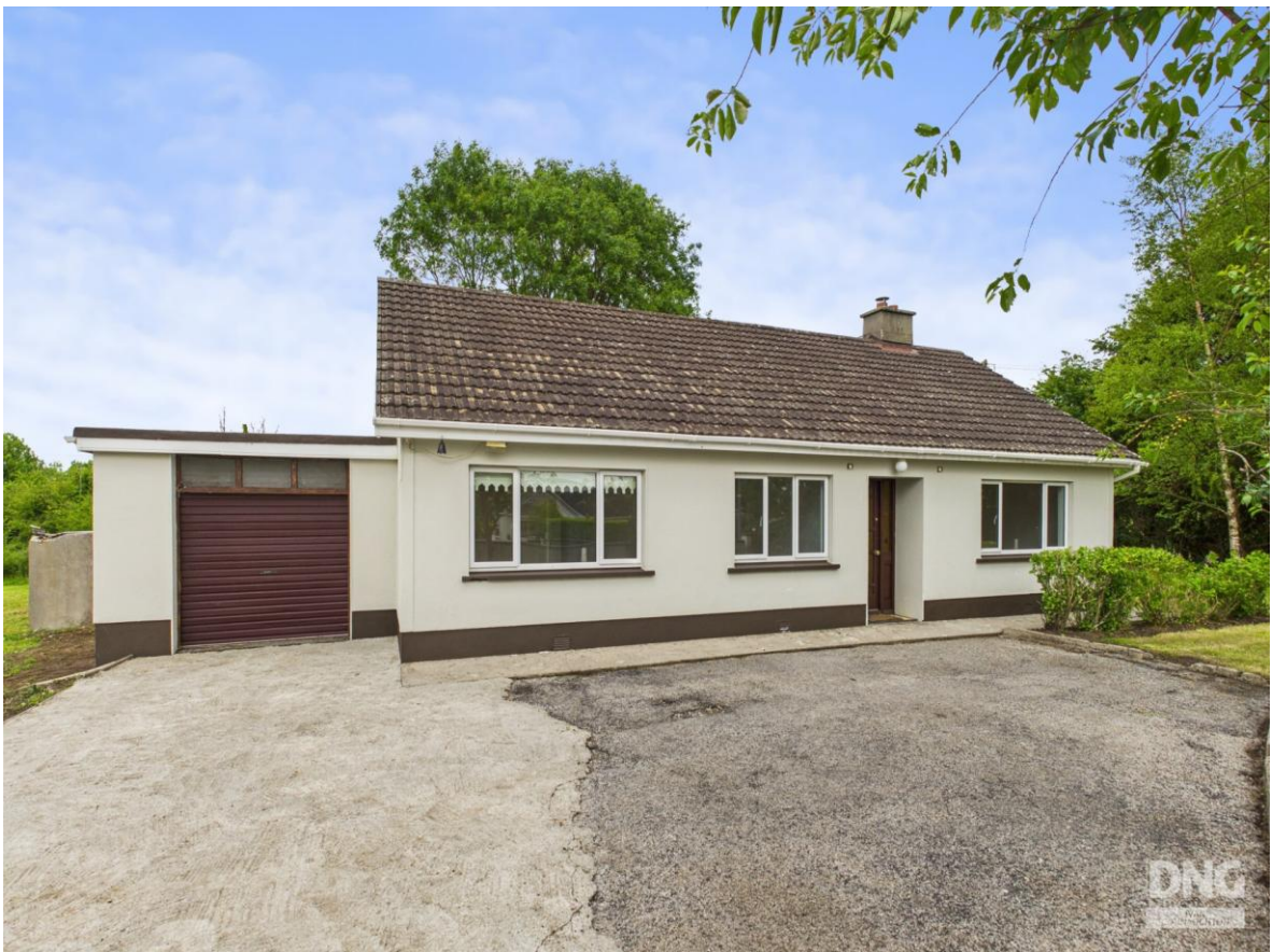
Clonboney, Lanesborough, Co. Longford. N39 HR84