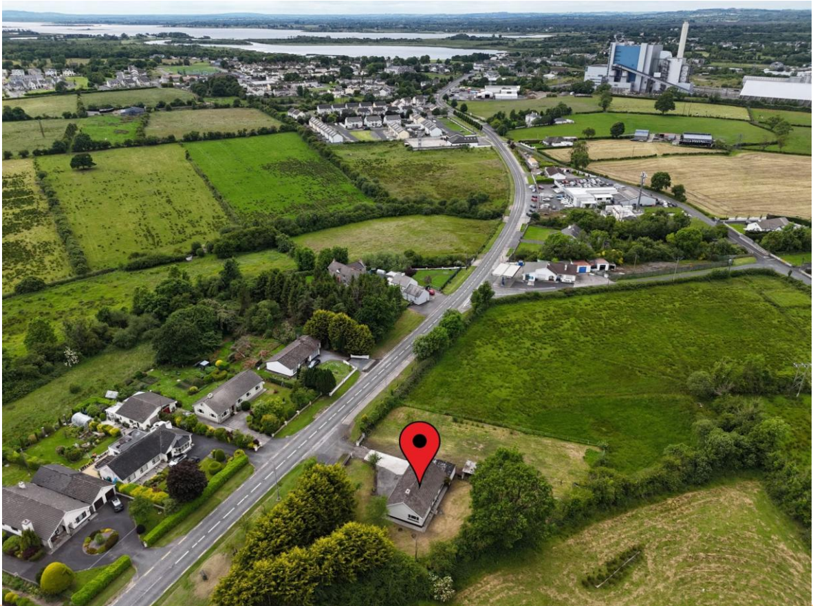
Clonboney, Lanesborough, Co. Longford. N39 HR84