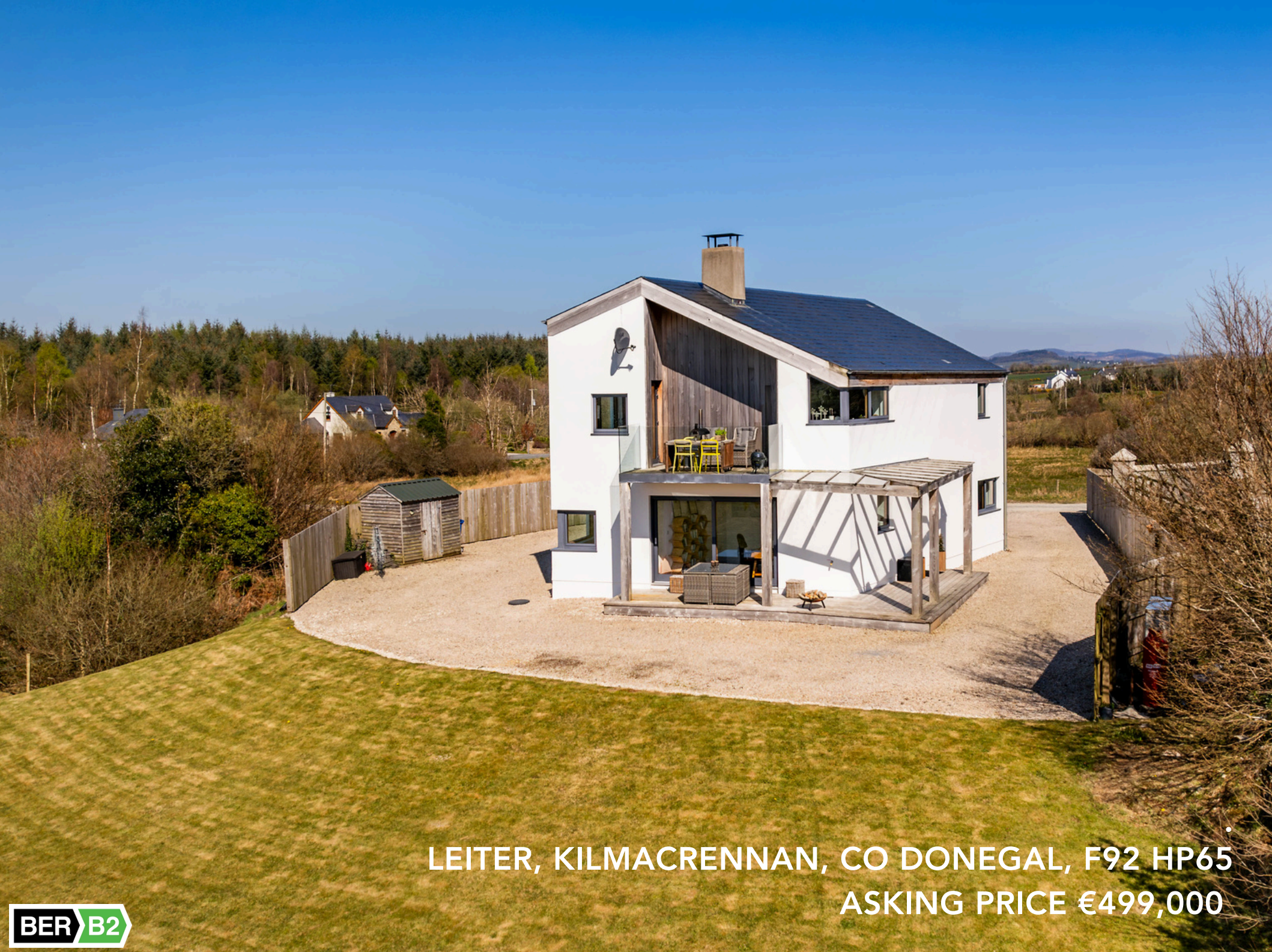
LEITER, KILMACRENNAN, CO DONEGAL, F92 HP65 ASKING PRICE €499,000