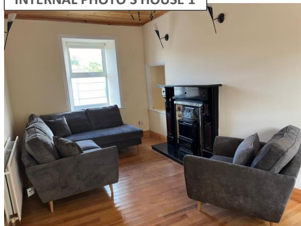
INTERNAL PHOTO'S HOUSE 1