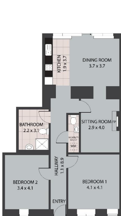
Cluin, Allihies P75 PN25 TOTAL APPROX. FLOOR AREA 96 SQ.M Whilst every attempt has been made to ensure the accuracy of the floor plan contained here, measurements of doors, windows, rooms and any other items are approximate and no responsibility is taken for any error, omission, or misstatement. This plan is for illustrative purposes only and should be used as such by any prospective purchaser.