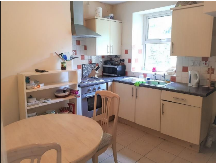
Kitchen / Dining Room

0.5 km west of Sligo town centre in direction of Maugheraboy.