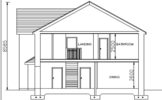
SECTION A-A SCALE : 1:100

FLOOR AREA- HSE 4B G. FLOOR = 85.7 F. FLOOR = 78.3 TOTAL 164 SQ. METRES 1765 SQ. FEET