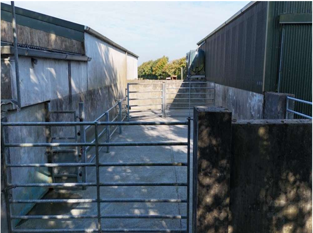
C. 34.80 Acres With Slatted Sheep Shed, Fairymount & Corry, Kilrooskey, County Roscommon