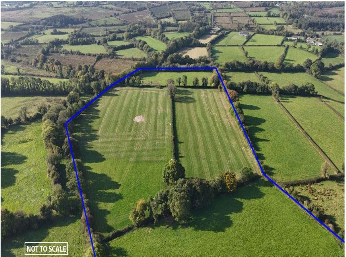
C. 34.80 Acres With Slatted Sheep Shed, Fairymount & Corry, Kilrooskey, County Roscommon