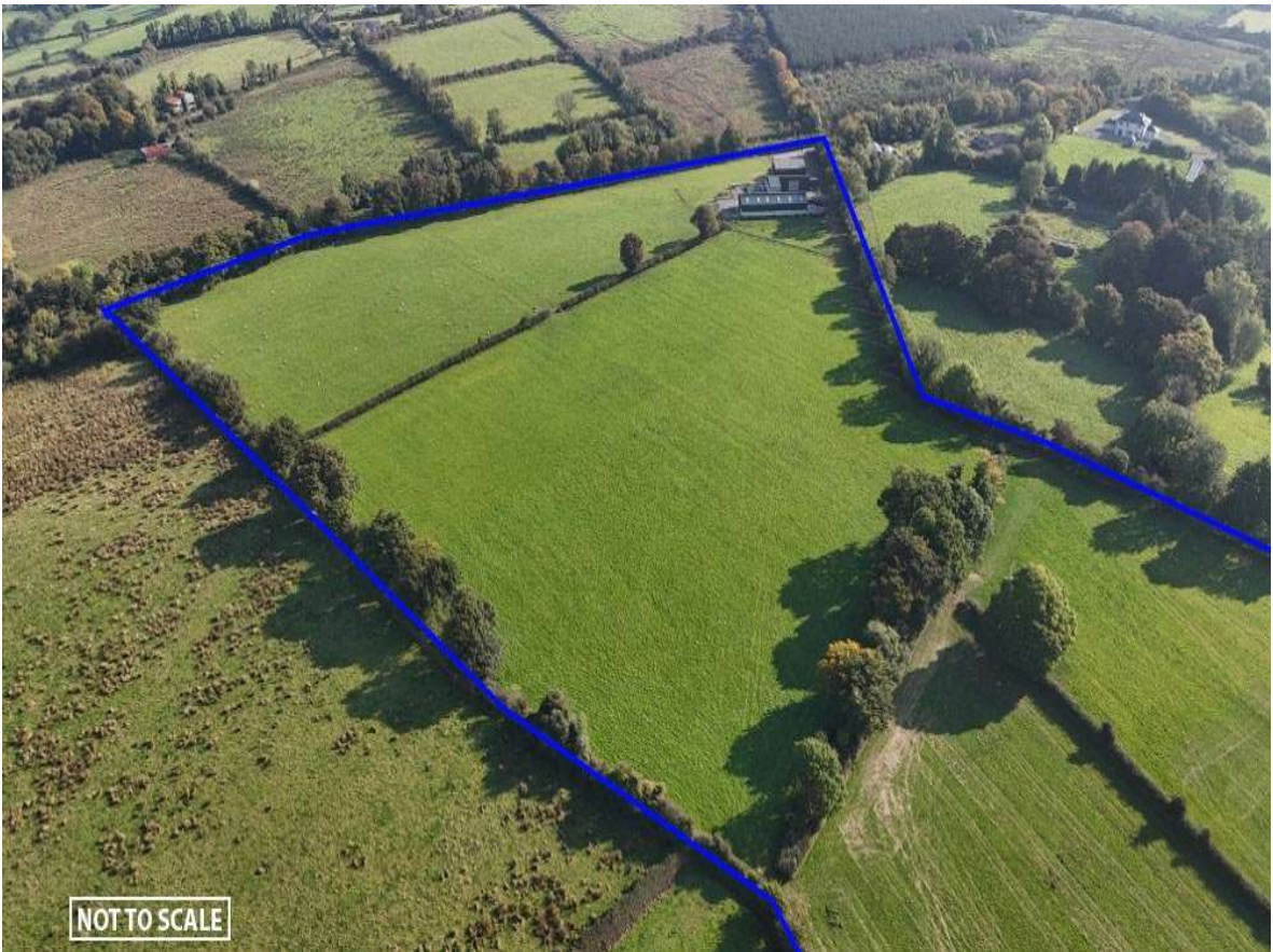
C. 34.80 Acres With Slatted Sheep Shed, Fairymount & Corry, Kilrooskey, County Roscommon