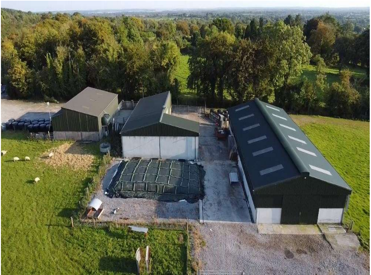
C. 34.80 Acres With Slatted Sheep Shed, Fairymount & Corry, Kilrooskey, County Roscommon