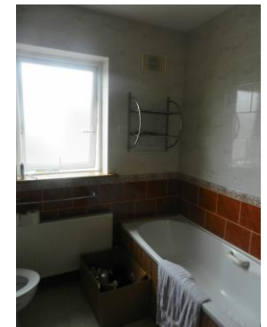
Bedroom 2 and main bathroom