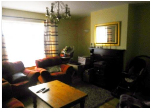
Kitchen & Sitting Room