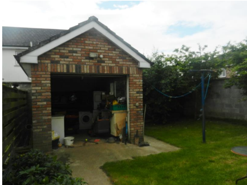
Garage to rear, plumbed for washing machine.

This home was built c.15 years ago and has been well maintained, there is excellent spacious living accommodation, great natural light coming into the house in all rooms, main bedroom is ensuite, downstairs toilet and built-in wardrobes in all three bedrooms.