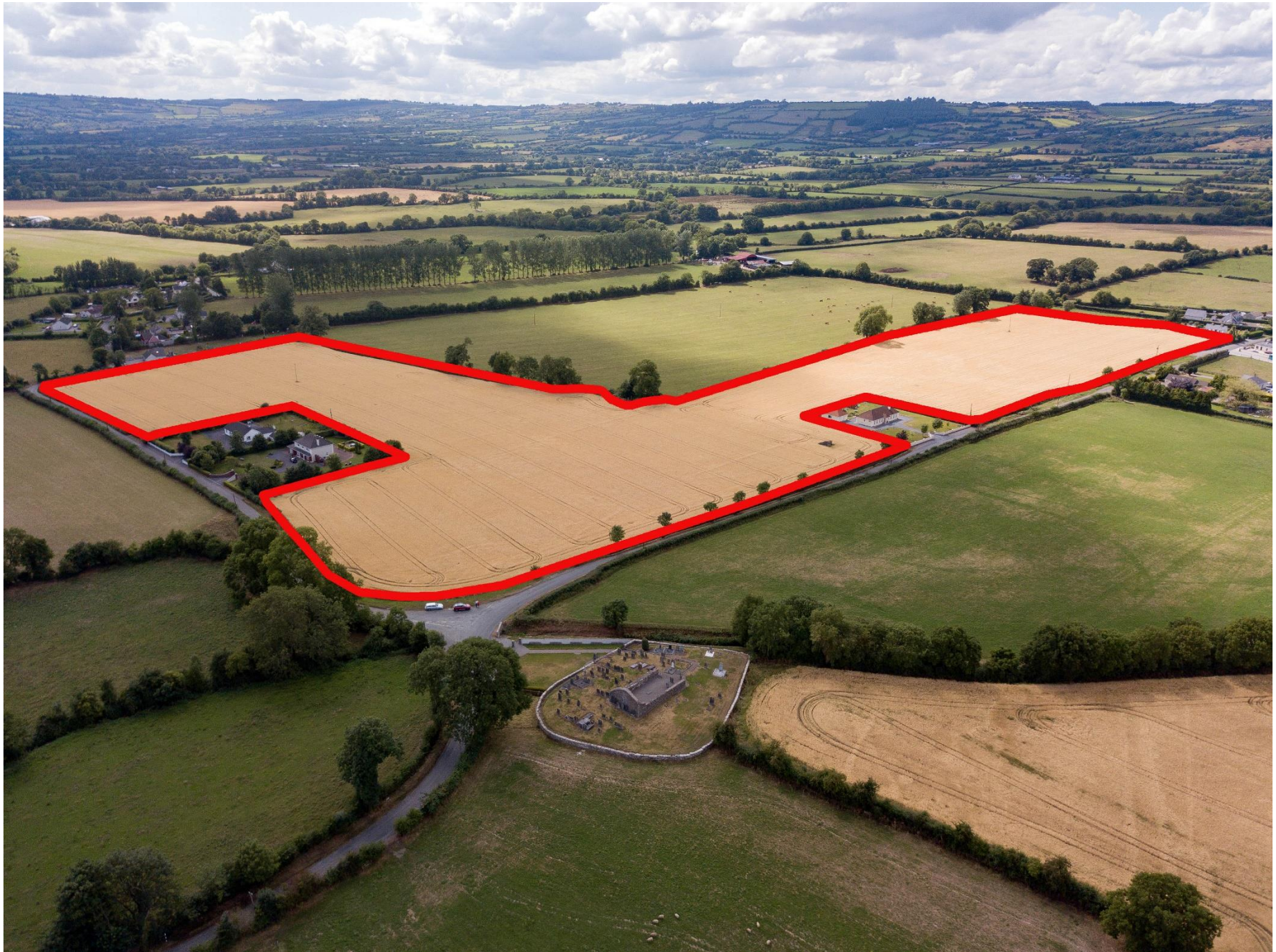
LOT 3 : C.23 ACRES OF PRIME ROADSIDE LANDS