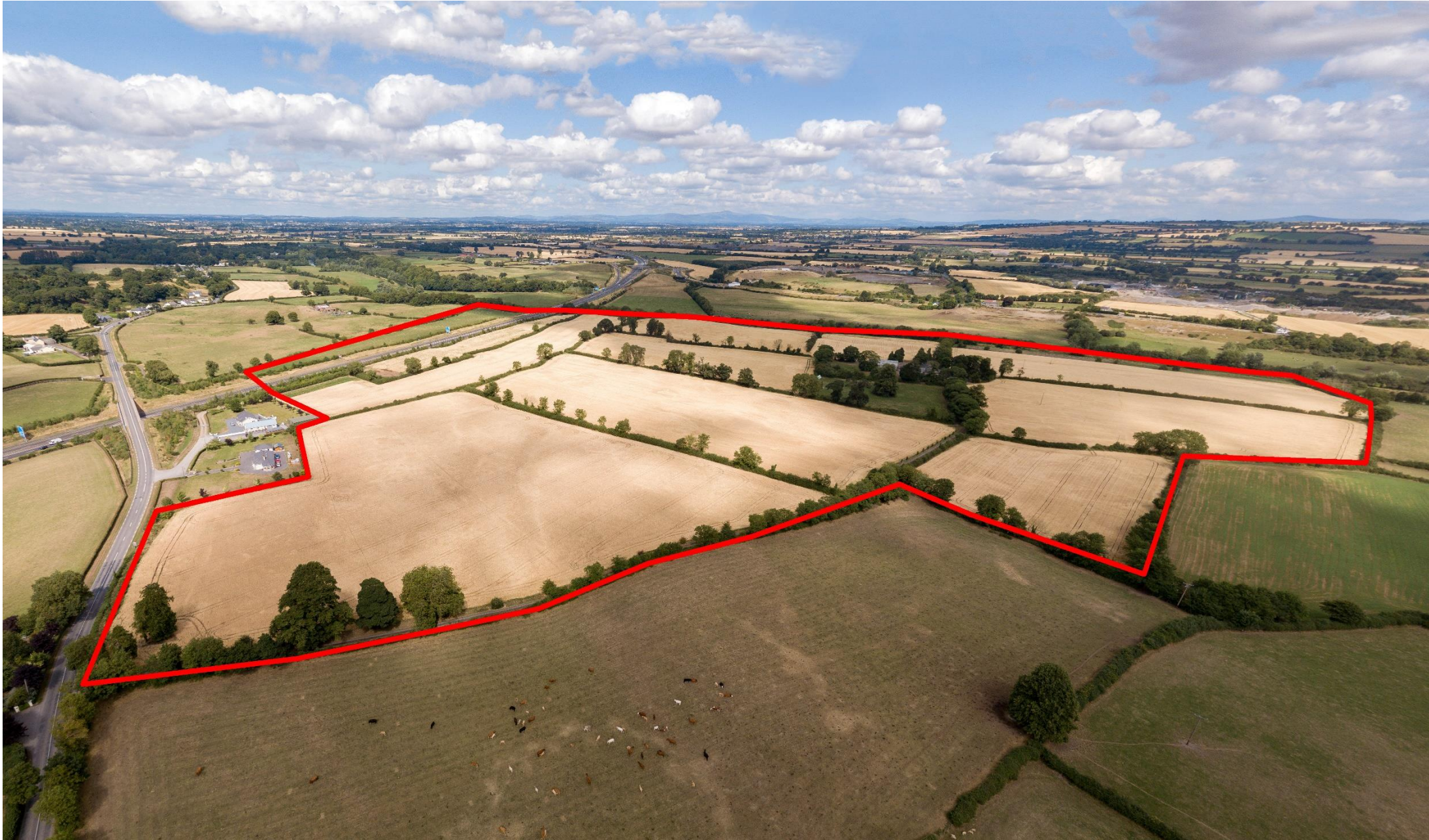
LOT 2 : C.103 ACRES WITH RESIDENCE, FARMYARD AND BUILDINGS.