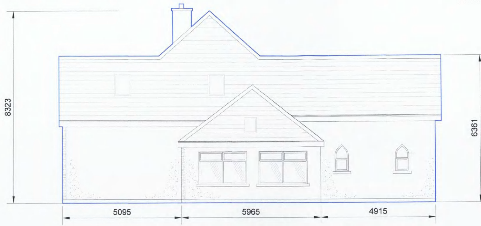
Existing Side Elevation (Scale 1:100)