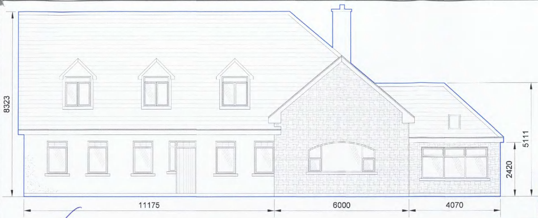
Existing Front Elevation (Scale 1:100)