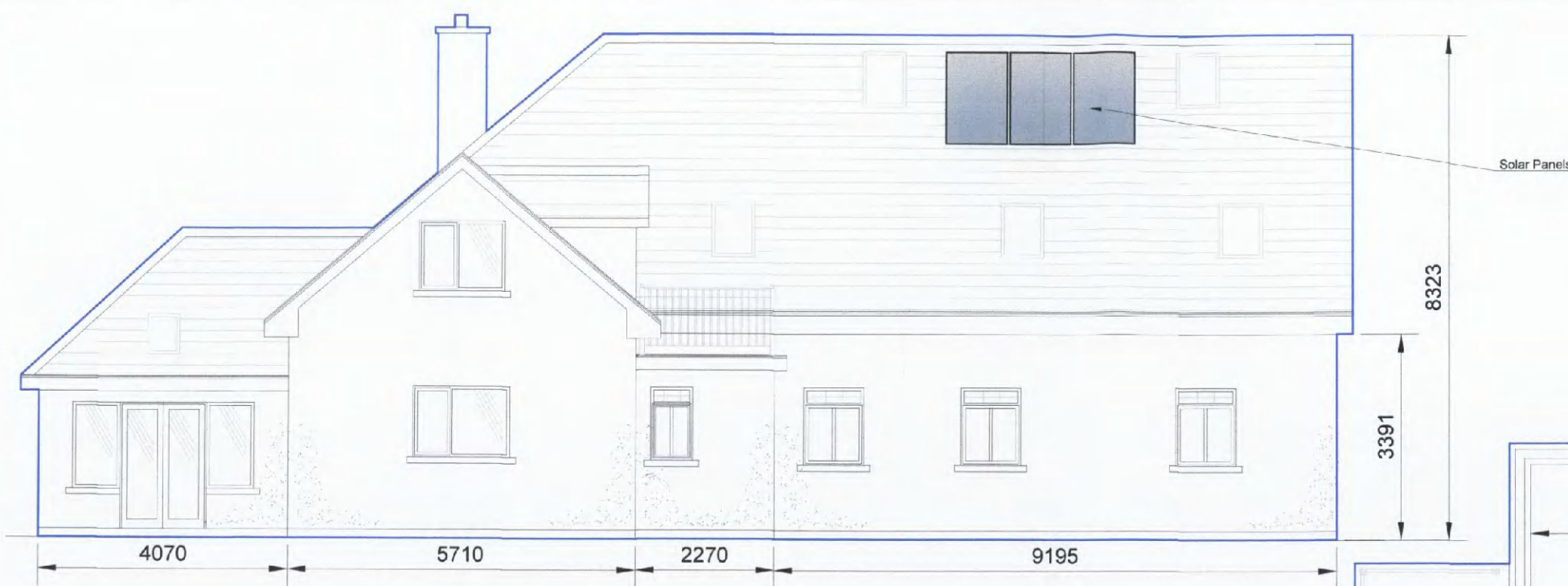
Existing Rear Elevation (Scale 1:100)