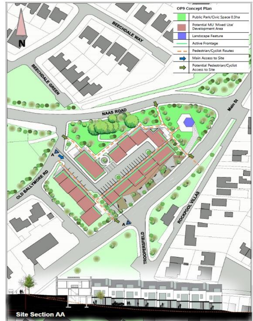
Figure B.1.X: Concept Plan for Opportunity Site 9