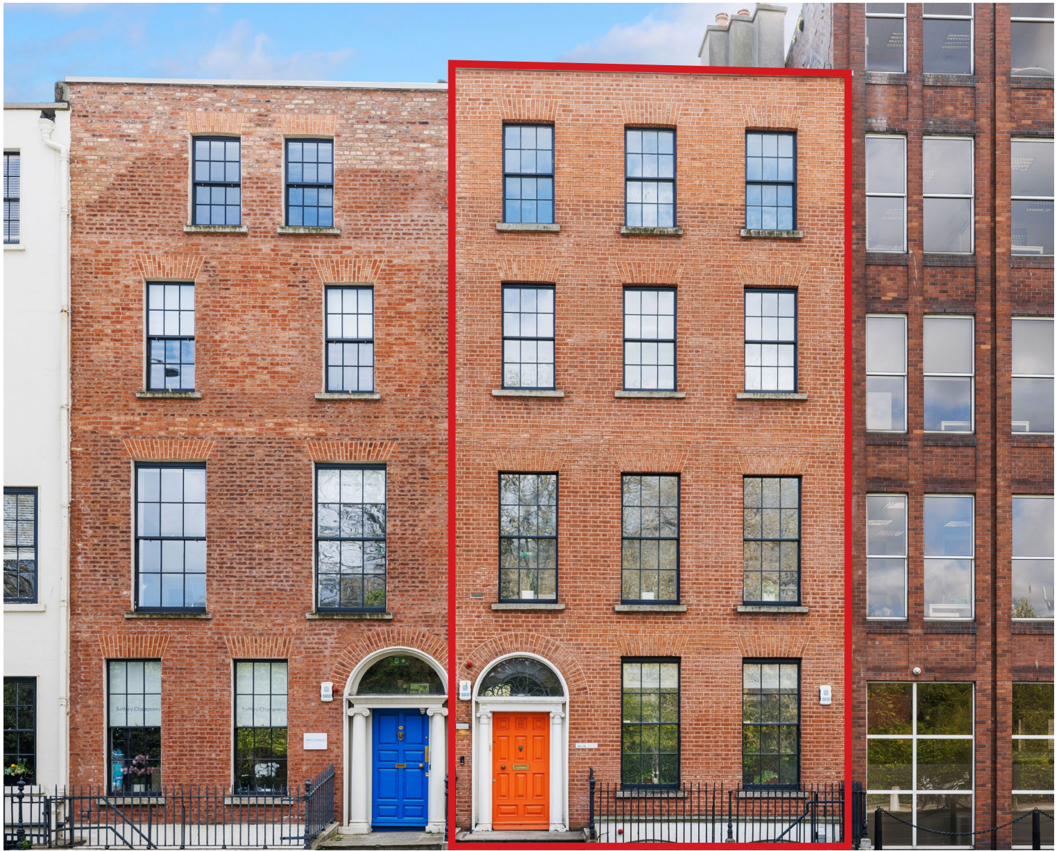
For identification purposes only.