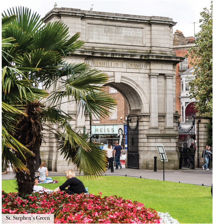
St. Stephen's Green

St. Stephen's Green retains many of the features created in 1880 including the large pond (which is fed from the Grand Canal at Portabello), a Bandstand, Gardener's Cottage, the Fusiliers Arch at the corner of the park opposite Grafton Street and the St. Stephen's Green kiosk, opposite The Shelbourne Hotel.