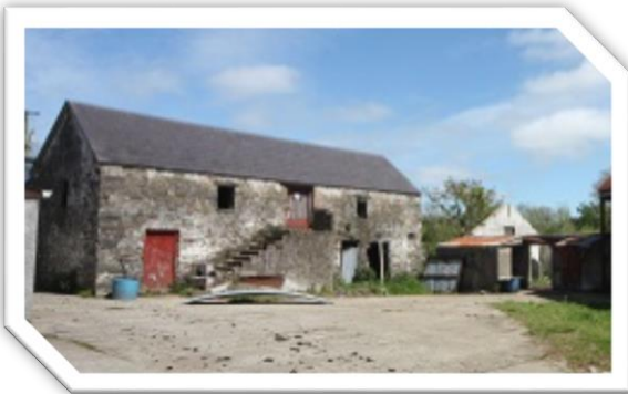
Lofted Shed in disrepair