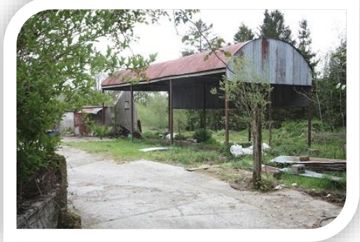
4 Bay Hayshed

Basic Payment Scheme Entitlements - 16.03 Units @ €200.31 each Average Indicative Apportionment Payments 2016 – 2019