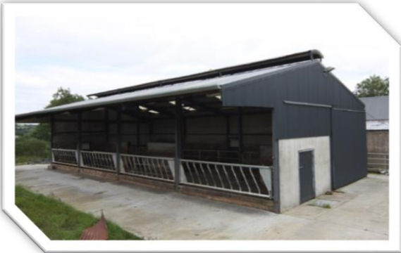
4 Bay Slatted Shed with creep feed and calving