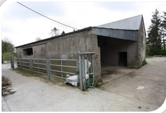
Lean to Machinery Shed