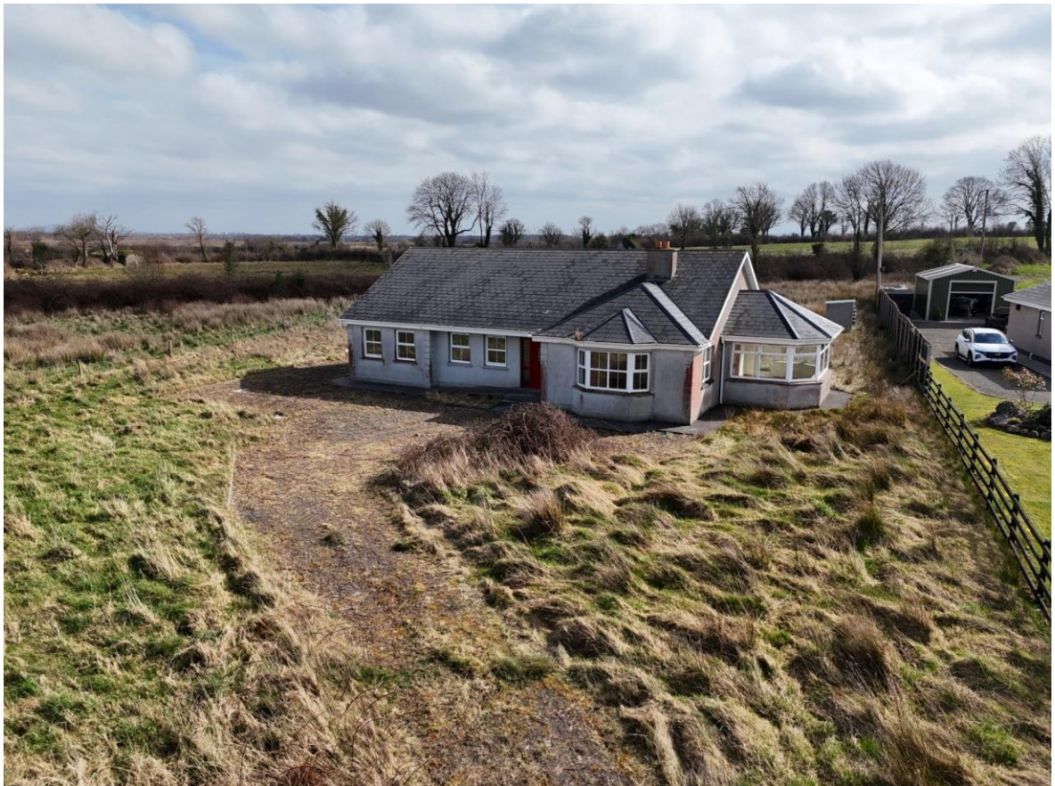
Drinagh, Tarmonbarry, Co. Roscommon. F42 NP93