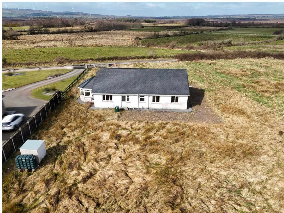
Drinagh, Tarmonbarry, Co. Roscommon. F42 NP93