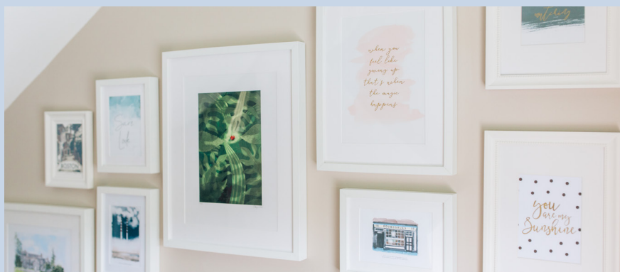
53 Belmayne Park North Interior