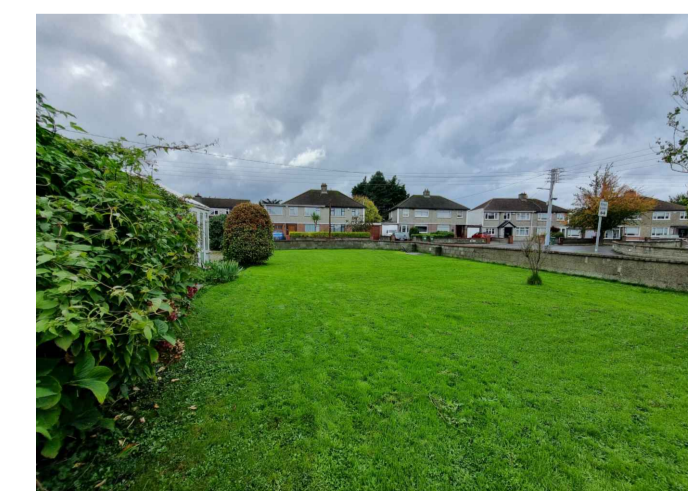
5) VIEW FROM REAR TO FRONT