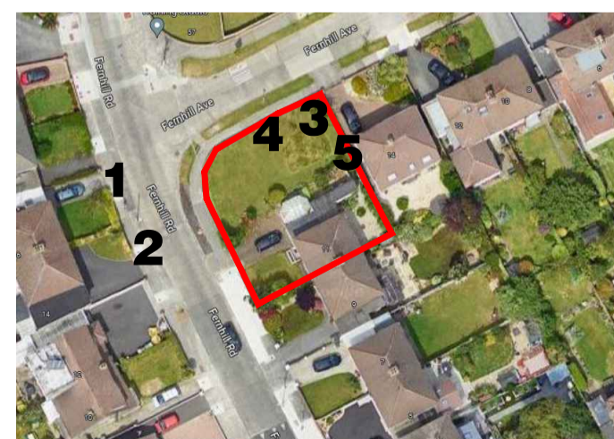
GOOGLE MAPS SITE VIEW

Do not scale if drawing size does not match sheet size K+B Architecture+Design 2 Ridgeway Villas, Kilmainham Lane Dublin 8 Ph.+353 (0)87 6816037 +353 (0)1 6588803 email. kbad.ie Drawing no. 436 - P-02 Revision A