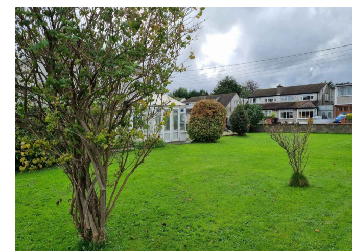
3) DIAGONAL VIEW TO FRONT FROM REAR SITE ANGLE