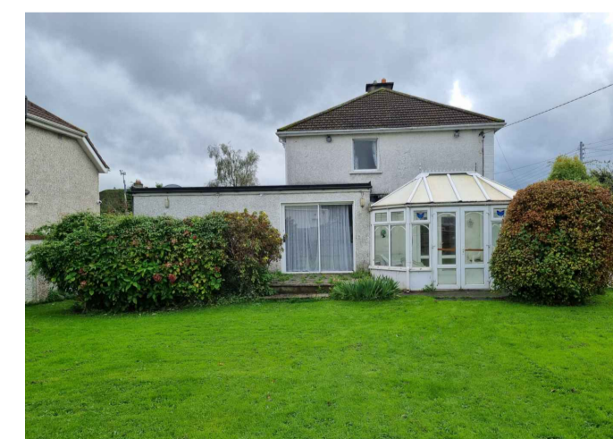
4) VIEW TO EXISTING HOUSE FROM MID SITE