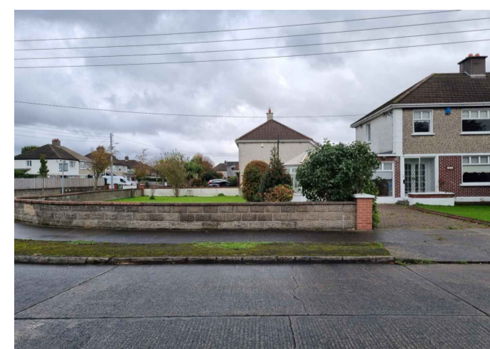
1) FRONT VIEW TO SITE