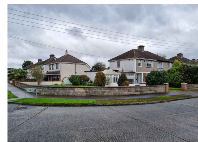
2) DIAGONAL VIEW TO SITE