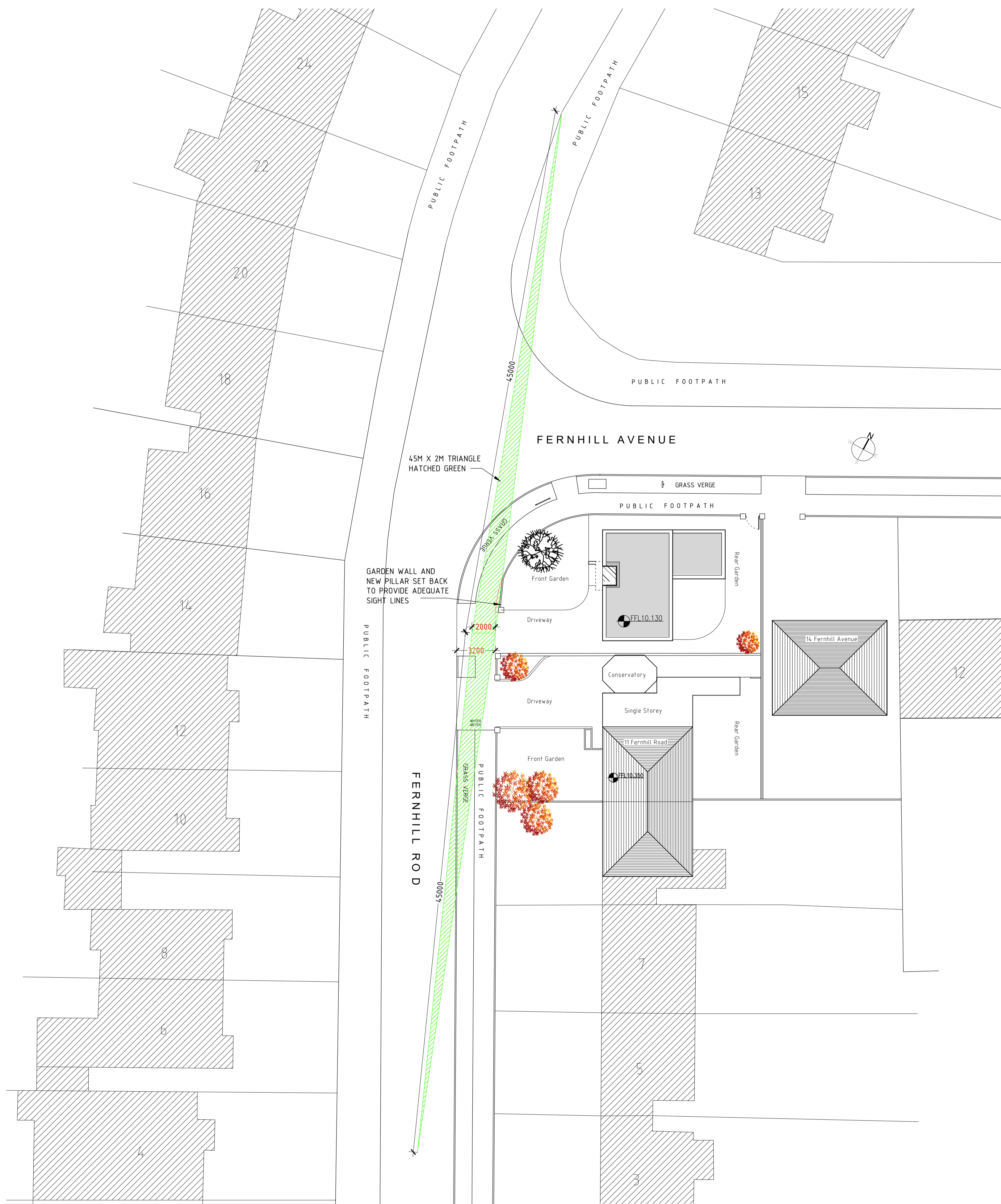
01 PROPOSED VEHICULAR SIGHT LINES AT DRIVEWAY SCALE 1:200