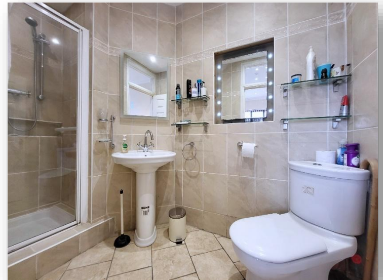
Carpets, Ensuite off