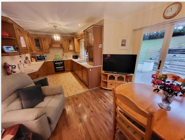
Kitchen / Dining