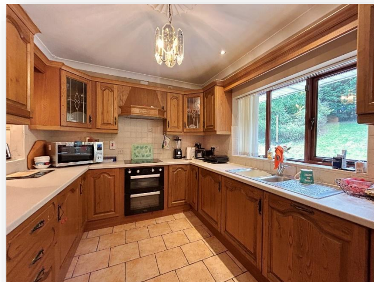
Fully fitted units,