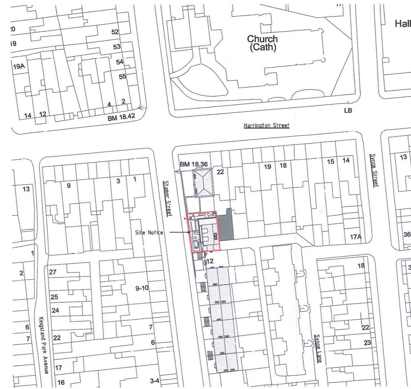
1 Site Location Map Map Series : 3263-20 1 : 1000 Ordnance Survey Ireland Licence No CYAL 50308349