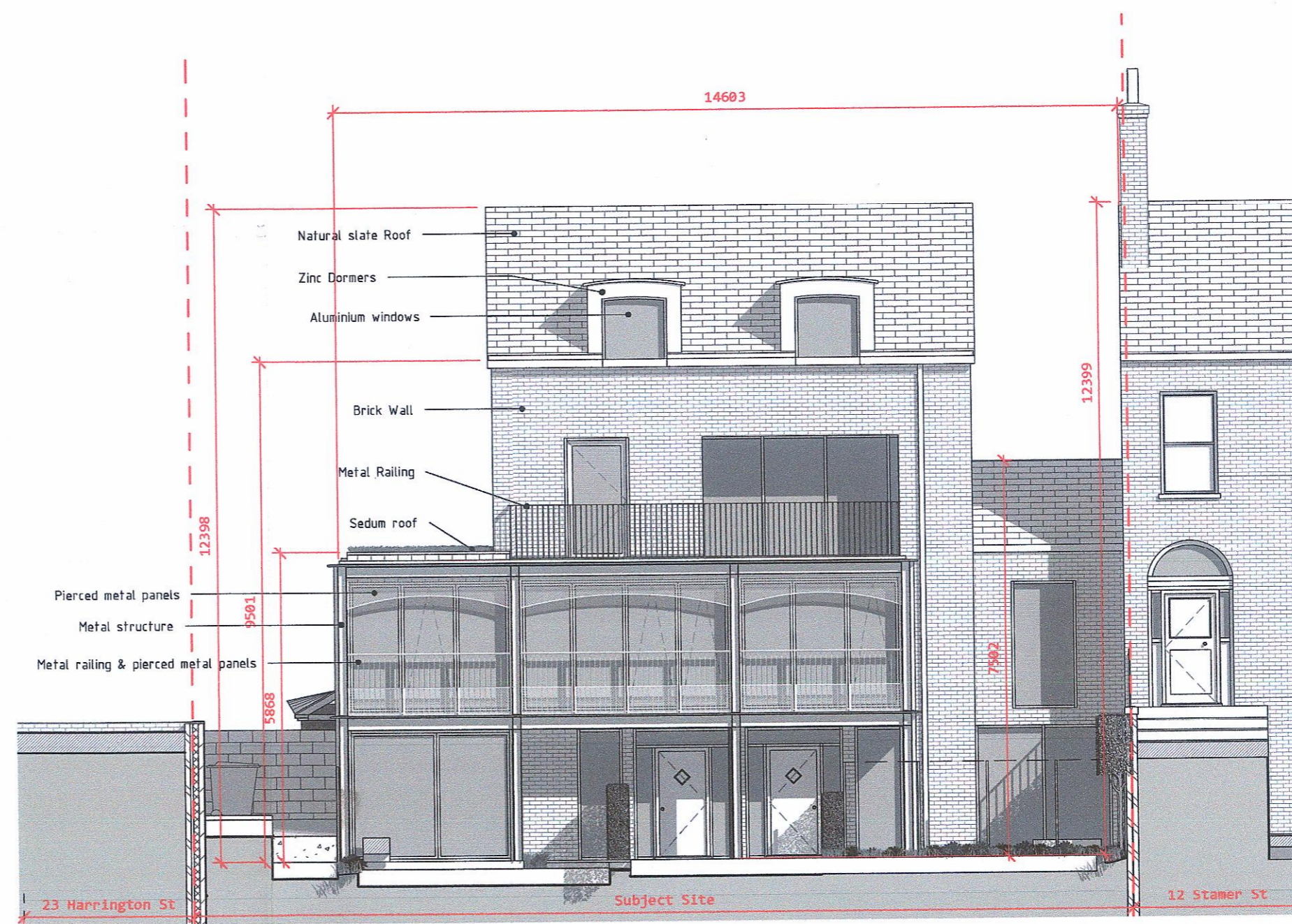
Proposed West Elevation 1 : 100