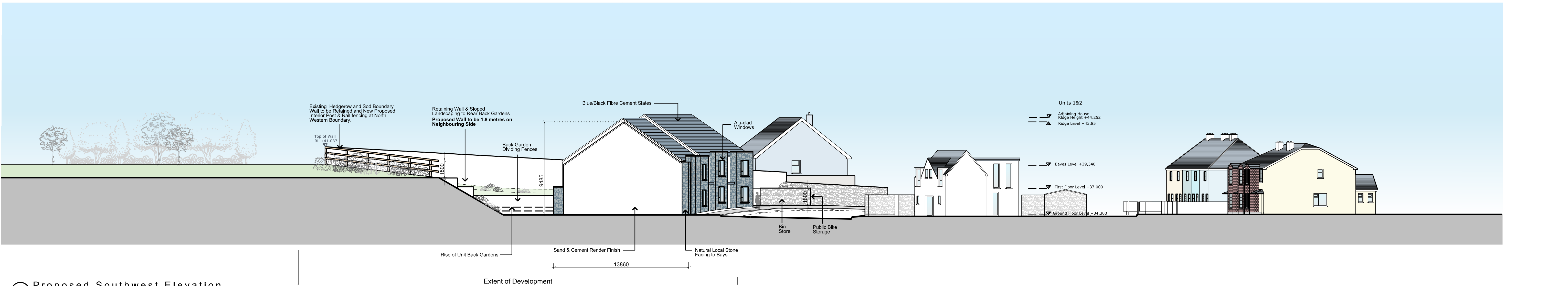
Proposed Southwest Elevation 1:200 @ A1