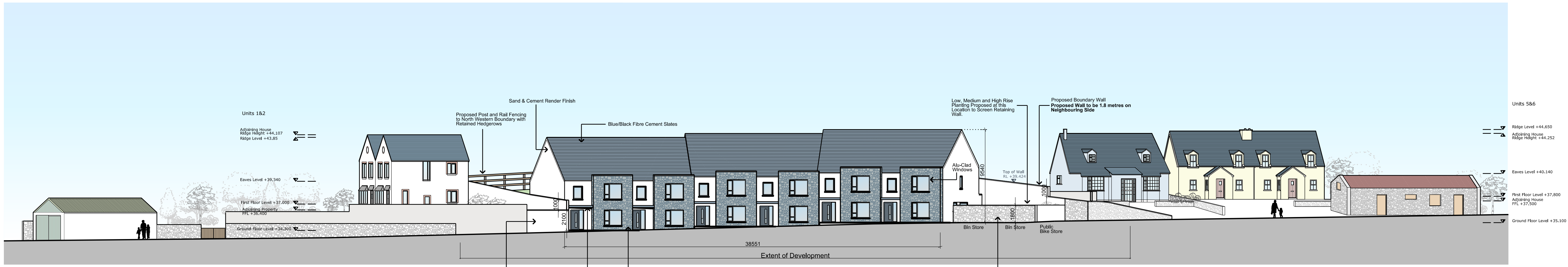
Proposed Street (Southeast) Elevation 1:200 @ A1