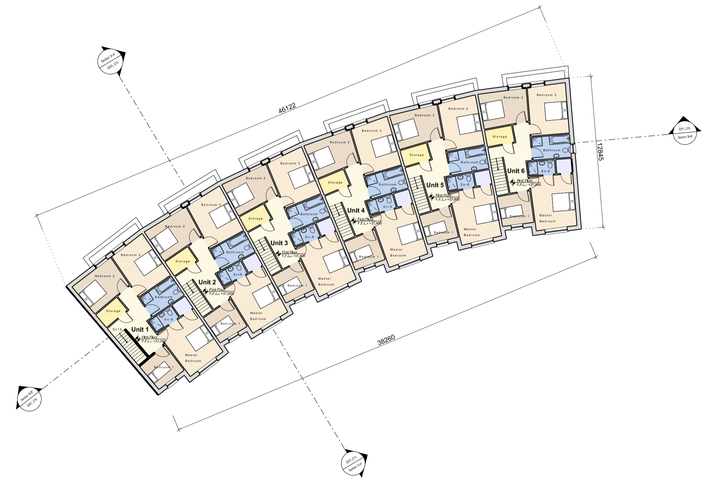
Proposed First Floor Plan 1:200 @ A1