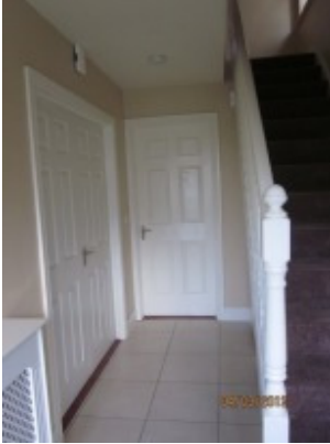
Entrance Hallway: ceramic tiles radiator cover