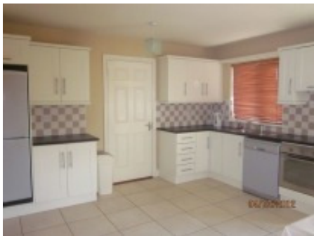
Kitchen Fully fitted kitchen, dishwasher, fridge oven hob and extractor fan