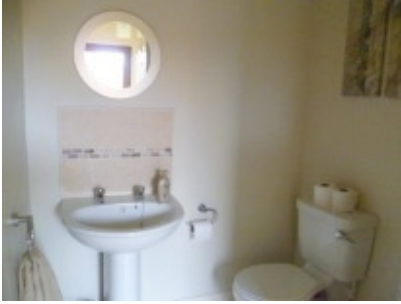
WC Ceramic tiles with WC