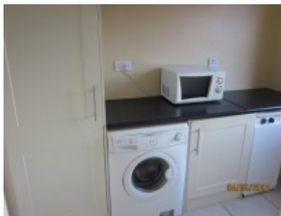
Utility Ceramic tiles, plumbed for appliances, washing machine, storage unit back door

Please note that all measurements and details are believed to be correct but any intending purchaser should satisfy himself/herself or otherwise as to the correctness of these particulars