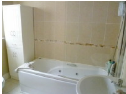
Bathroom Ceramic tile Triton T90 shower, Jacuzzi bath WC WHB