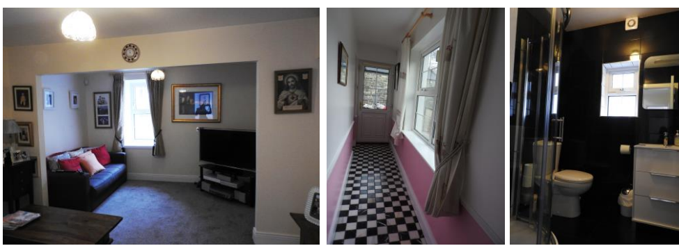
Livingroom off the kitchen with access to hallway (separate entrance) and shower room