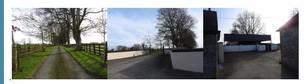
Tree Lined Avenue Access leading to residence in a walled in yard with haybarn and numerous out-buildings

Kindly note that any negotiations respecting the above property are conducted through us. We do not hold ourselves responsible in any way for inaccuracy, but will take every care in preparing particulars. All offers are subject to the property being unsold, let or withdrawn. The above may be seen by appointment only. Any reasonable offer will be submitted to the owner for consideration. If the property does not interest you, kindly advise us as to your exact requirements.