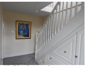
Stairs to bedroom with under stairs storage and walk in wardrobe with slide robes opposite