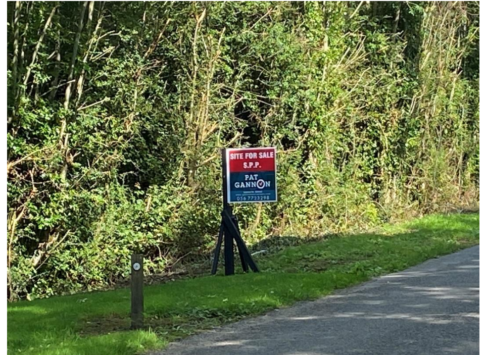
C.3/4 OF AN ACRE AT FOLIO NO: KK 3885