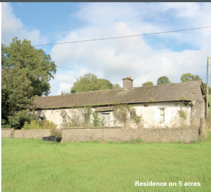
Residence on 5 acres