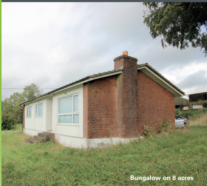
Bungalow on 8 acres