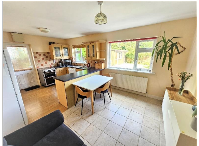
Kitchen / Dining Room