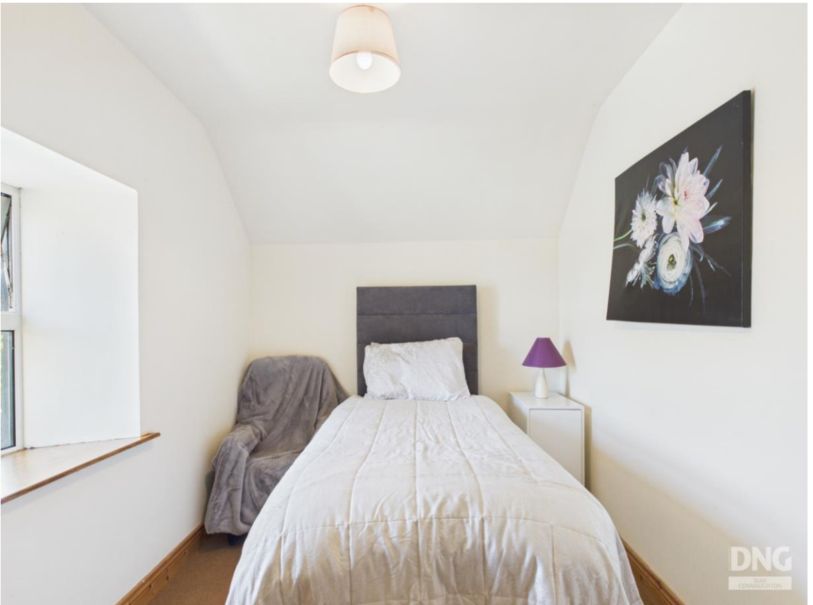
Lot 3: Residence On C. 1.50 Acres, Castleteheen, Castlerea, Co. Roscommon. F45 K304