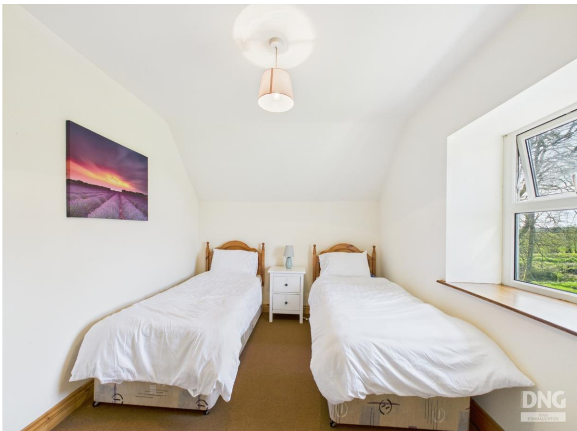
Lot 3: Residence On C. 1.50 Acres, Castleteheen, Castlerea, Co. Roscommon. F45 K304