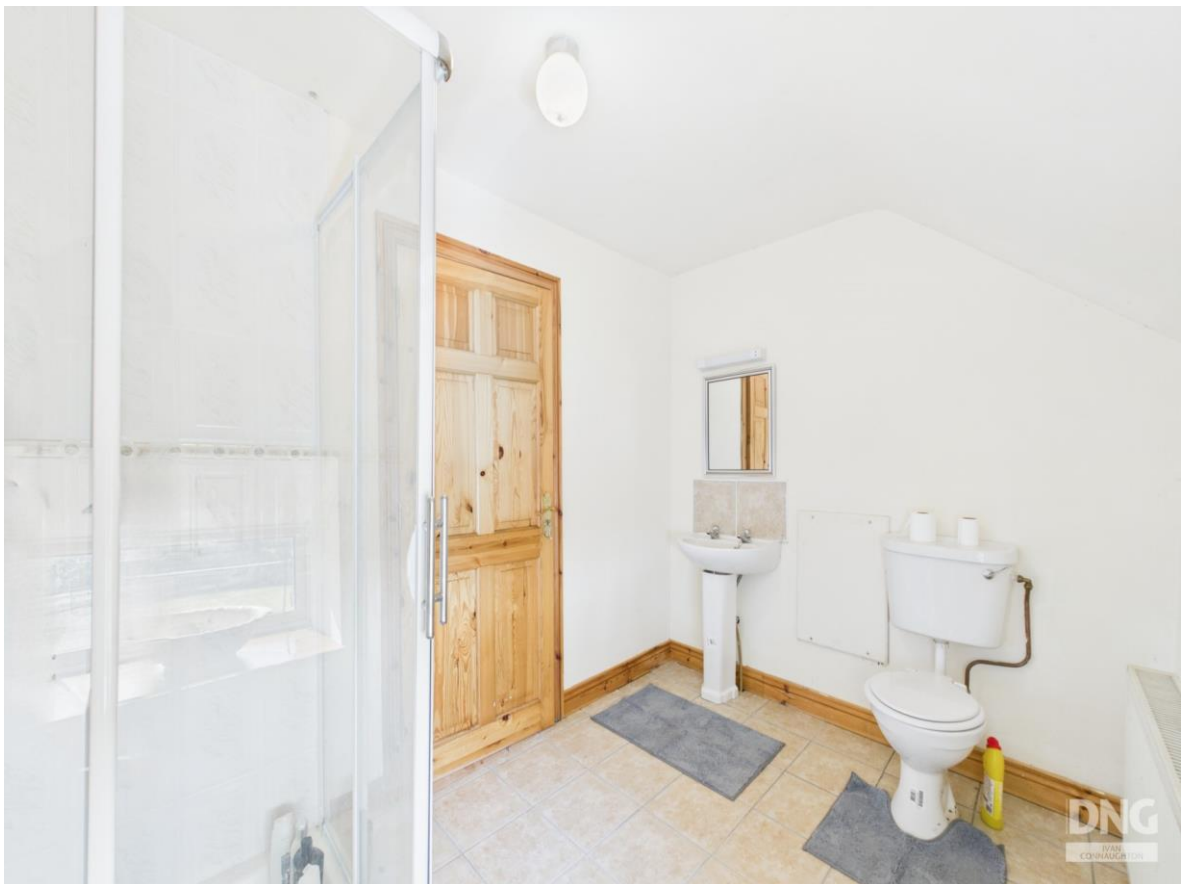
Lot 3: Residence On C. 1.50 Acres, Castleteheen, Castlerea, Co. Roscommon. F45 K304