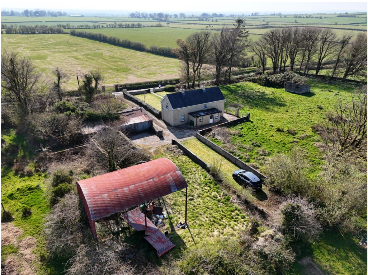
Lot 3: Residence On C. 1.50 Acres, Castleteheen, Castlerea, Co. Roscommon. F45 K304