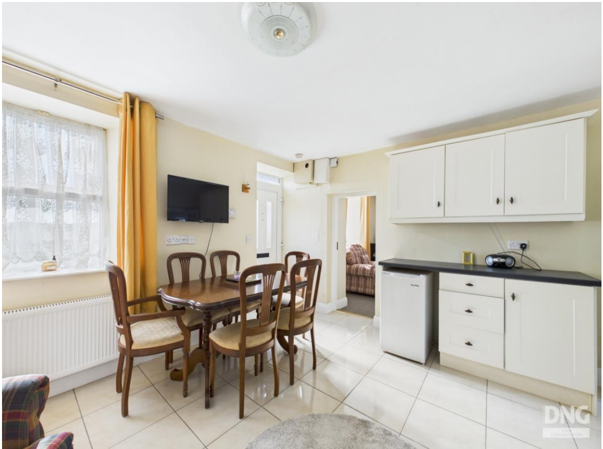
Lot 3: Residence On C. 1.50 Acres, Castleteheen, Castlerea, Co. Roscommon. F45 K304