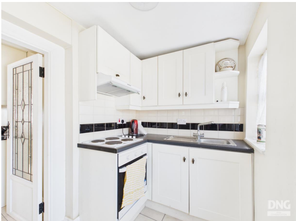
Lot 3: Residence On C. 1.50 Acres, Castleteheen, Castlerea, Co. Roscommon. F45 K304