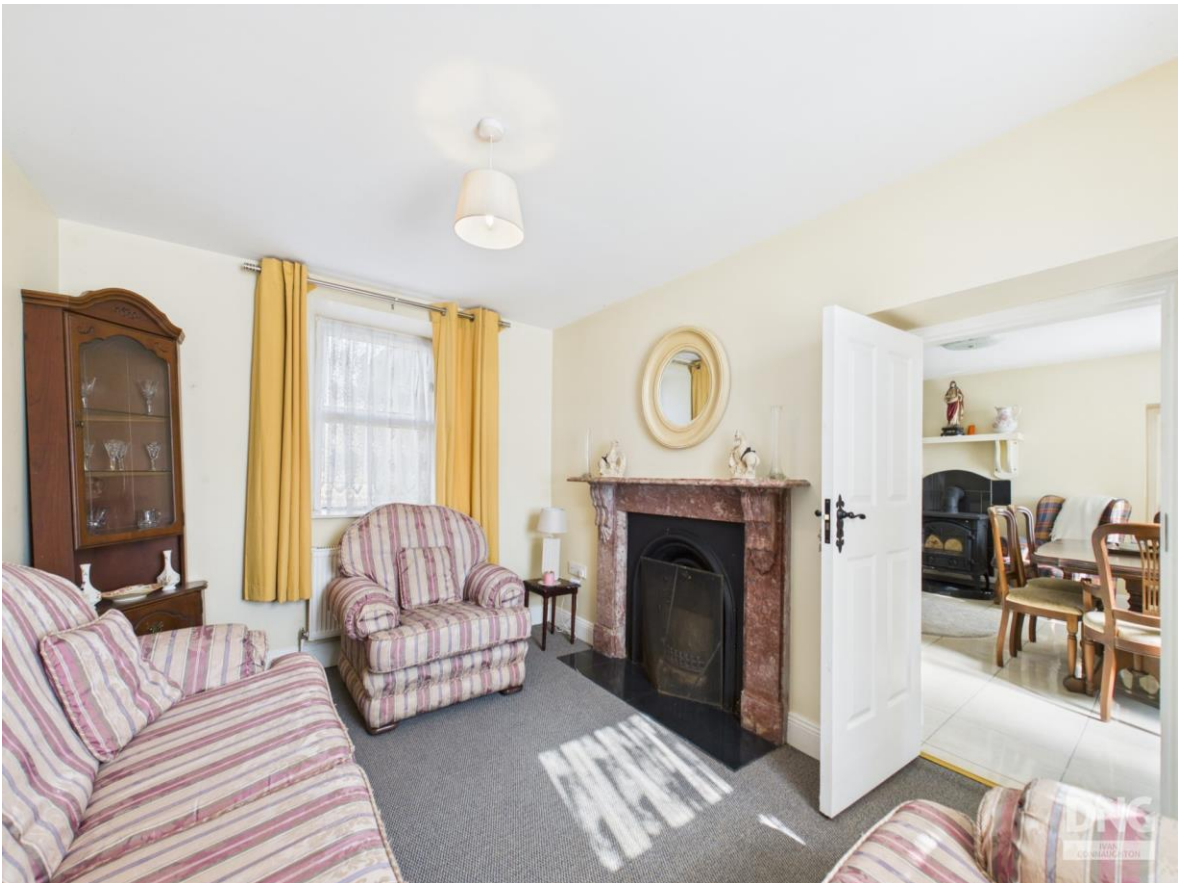
Lot 3: Residence On C. 1.50 Acres, Castleteheen, Castlerea, Co. Roscommon. F45 K304