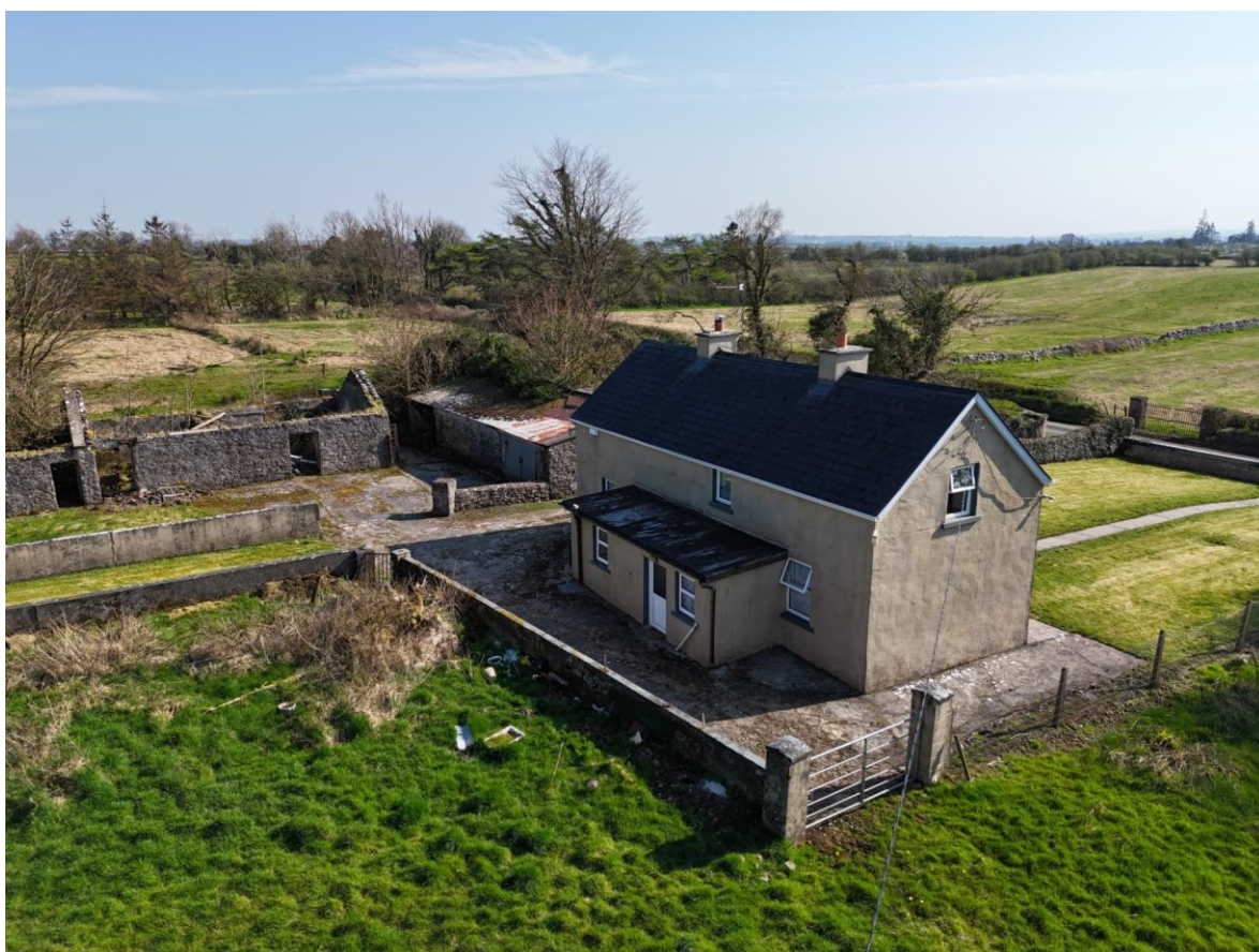
Lot 3: Residence On C. 1.50 Acres, Castleteheen, Castlerea, Co. Roscommon. F45 K304