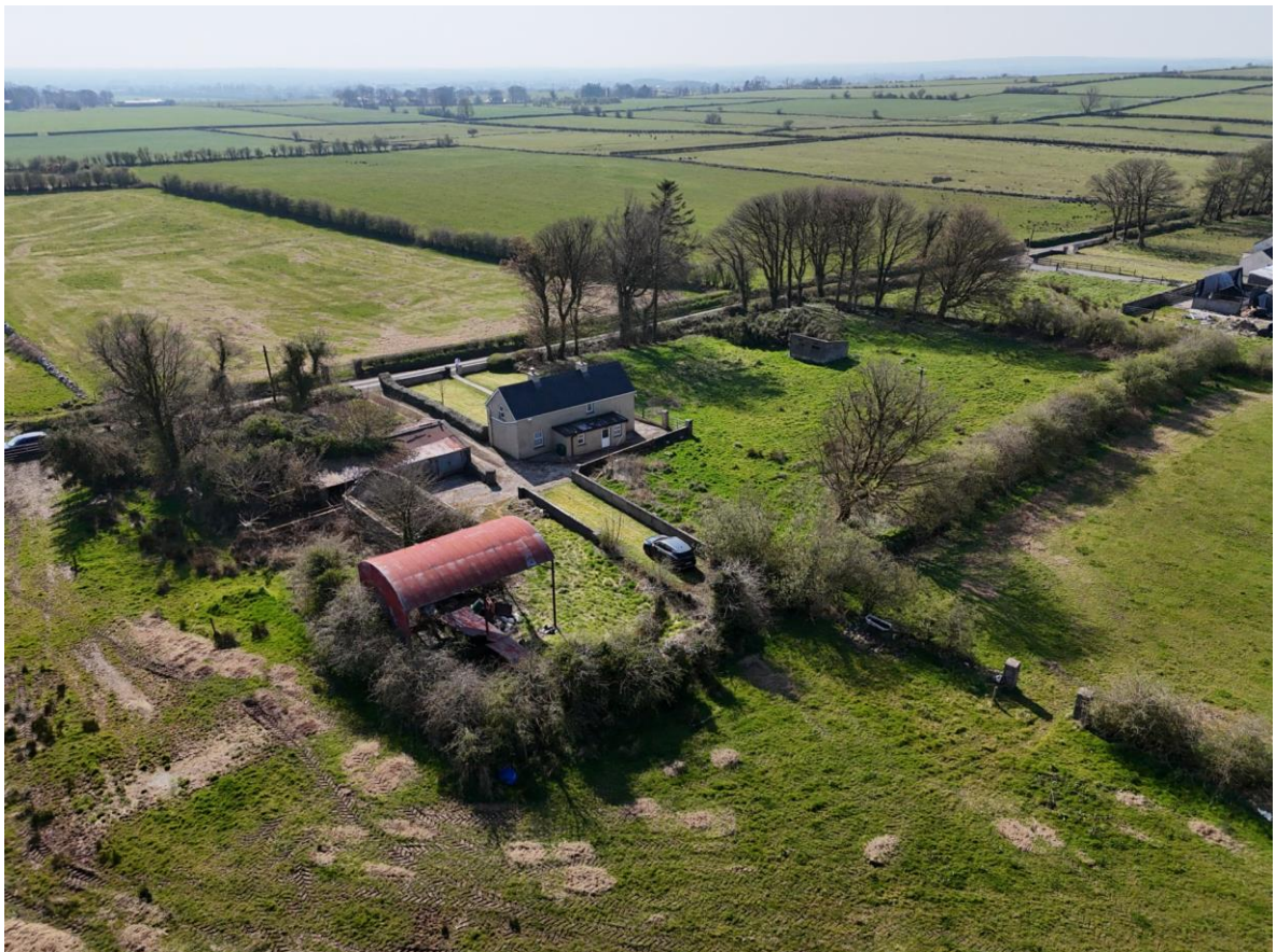
Lot 3: Residence On C. 1.50 Acres, Castleteheen, Castlerea, Co. Roscommon. F45 K304