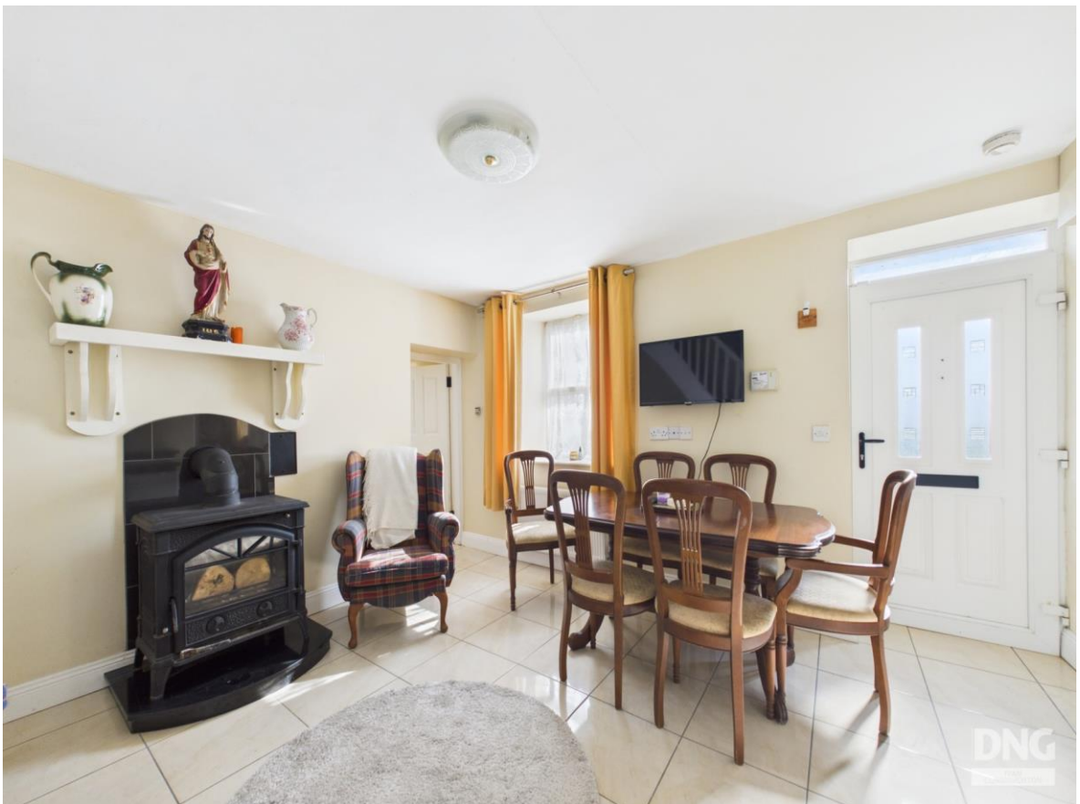
Lot 3: Residence On C. 1.50 Acres, Castleteheen, Castlerea, Co. Roscommon. F45 K304