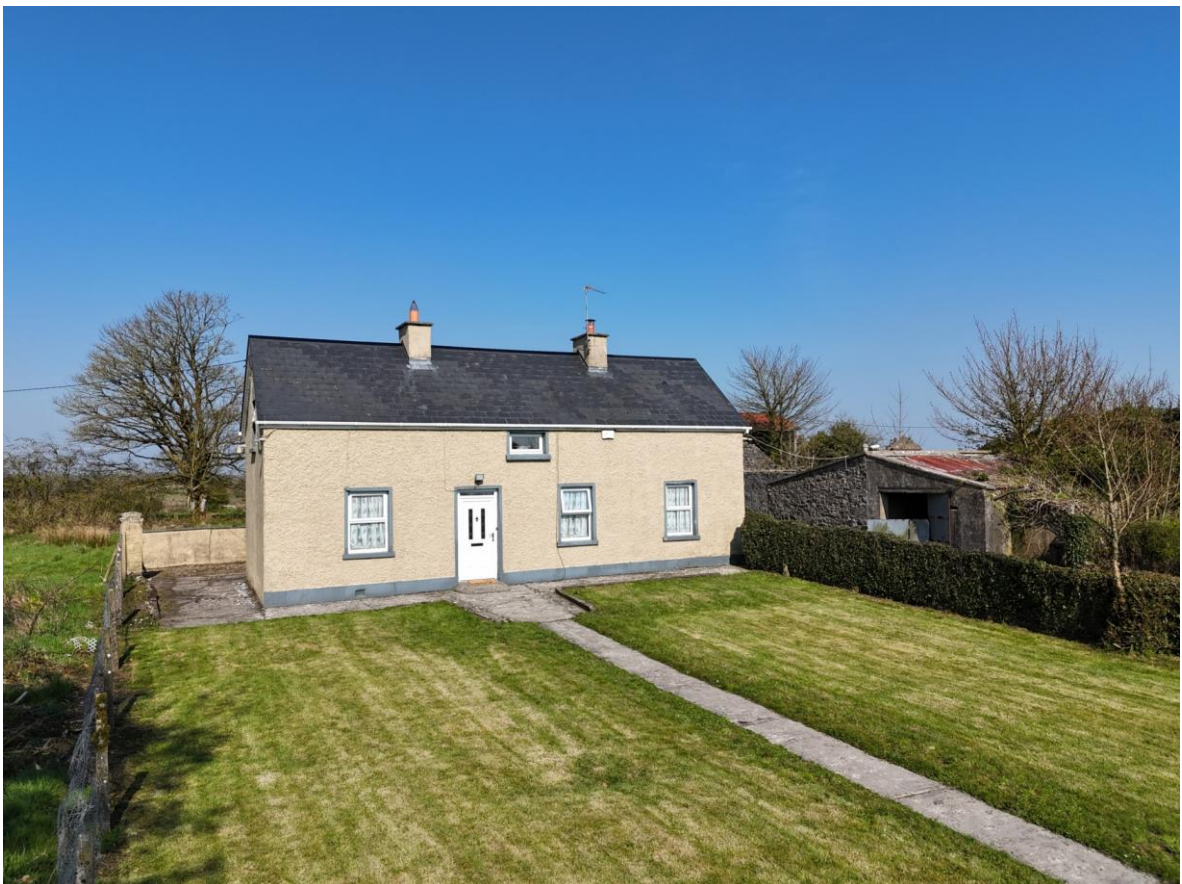
Lot 3: Residence On C. 1.50 Acres, Castleteheen, Castlerea, Co. Roscommon. F45 K304