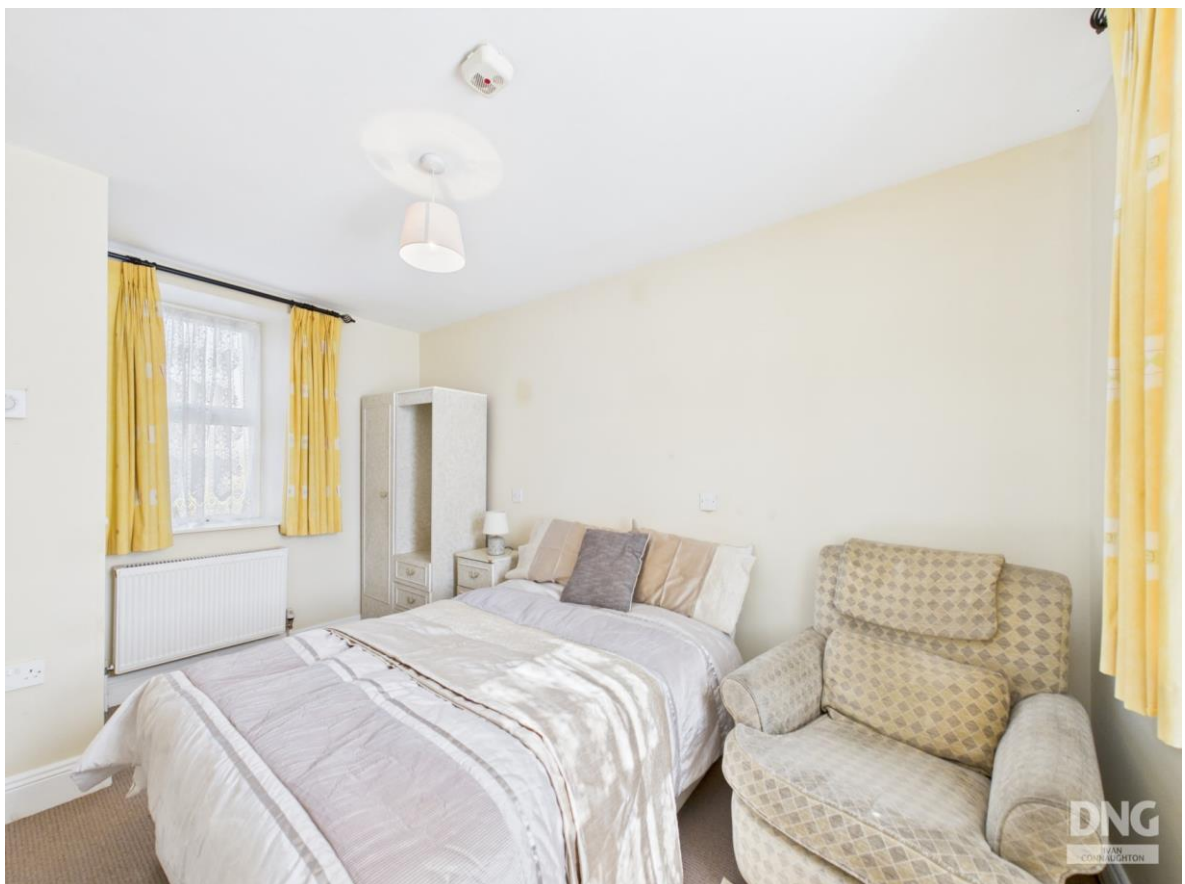
Lot 3: Residence On C. 1.50 Acres, Castleteheen, Castlerea, Co. Roscommon. F45 K304