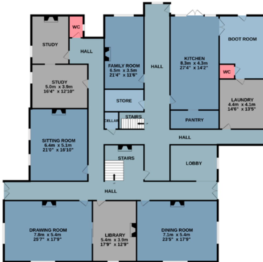
GROUND FLOOR 417.0 sq.m. (4488 sq.ft.) approx.