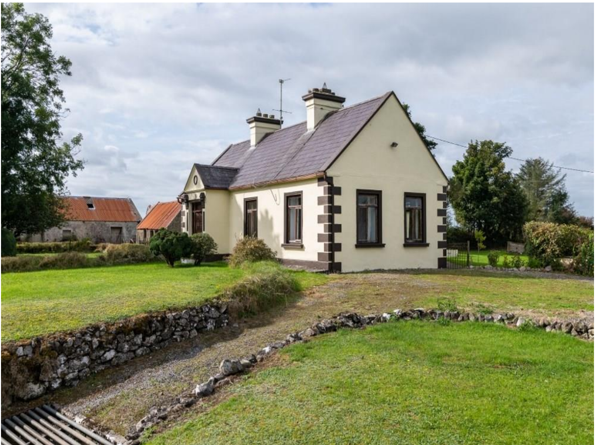
Shannagh Beg, Glenamaddy, Co. Galway. F45 CX99