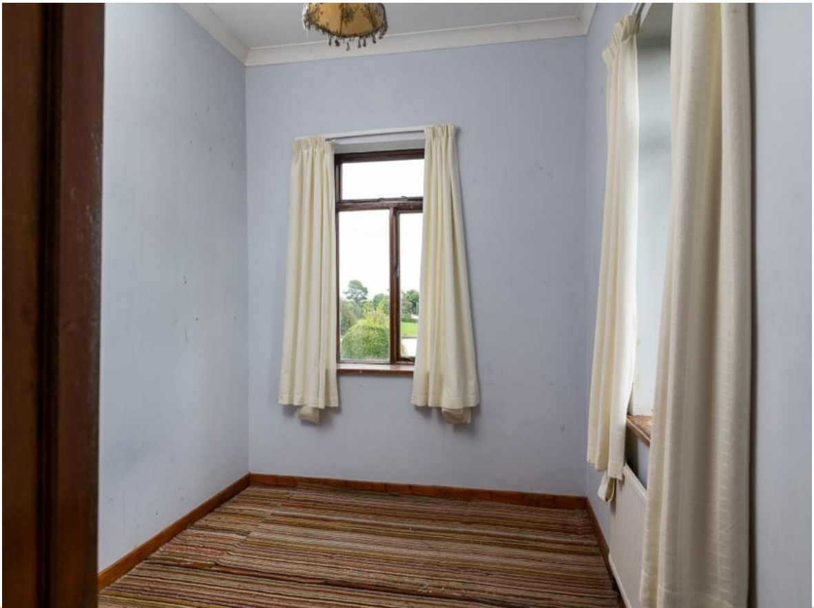
Shannagh Beg, Glenamaddy, Co. Galway. F45 CX99