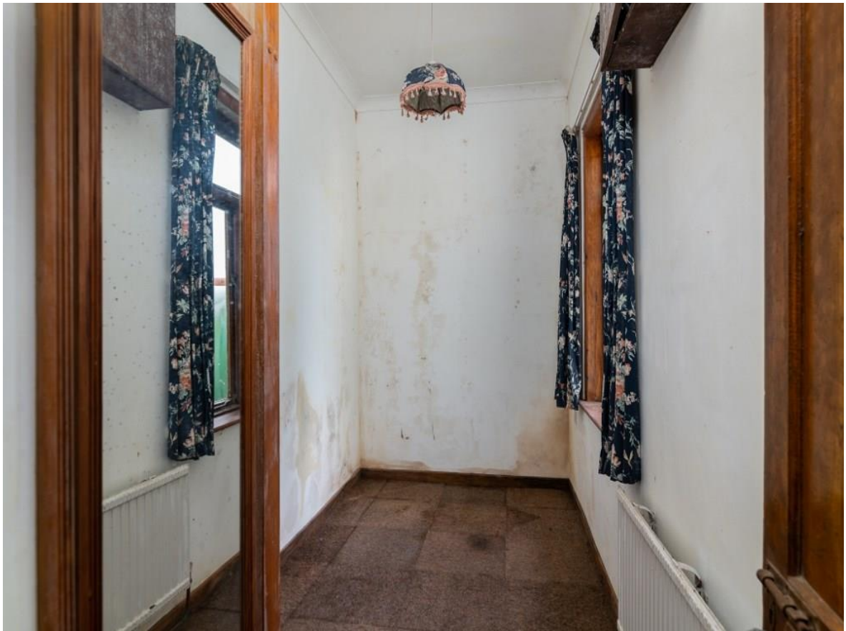
Shannagh Beg, Glenamaddy, Co. Galway. F45 CX99