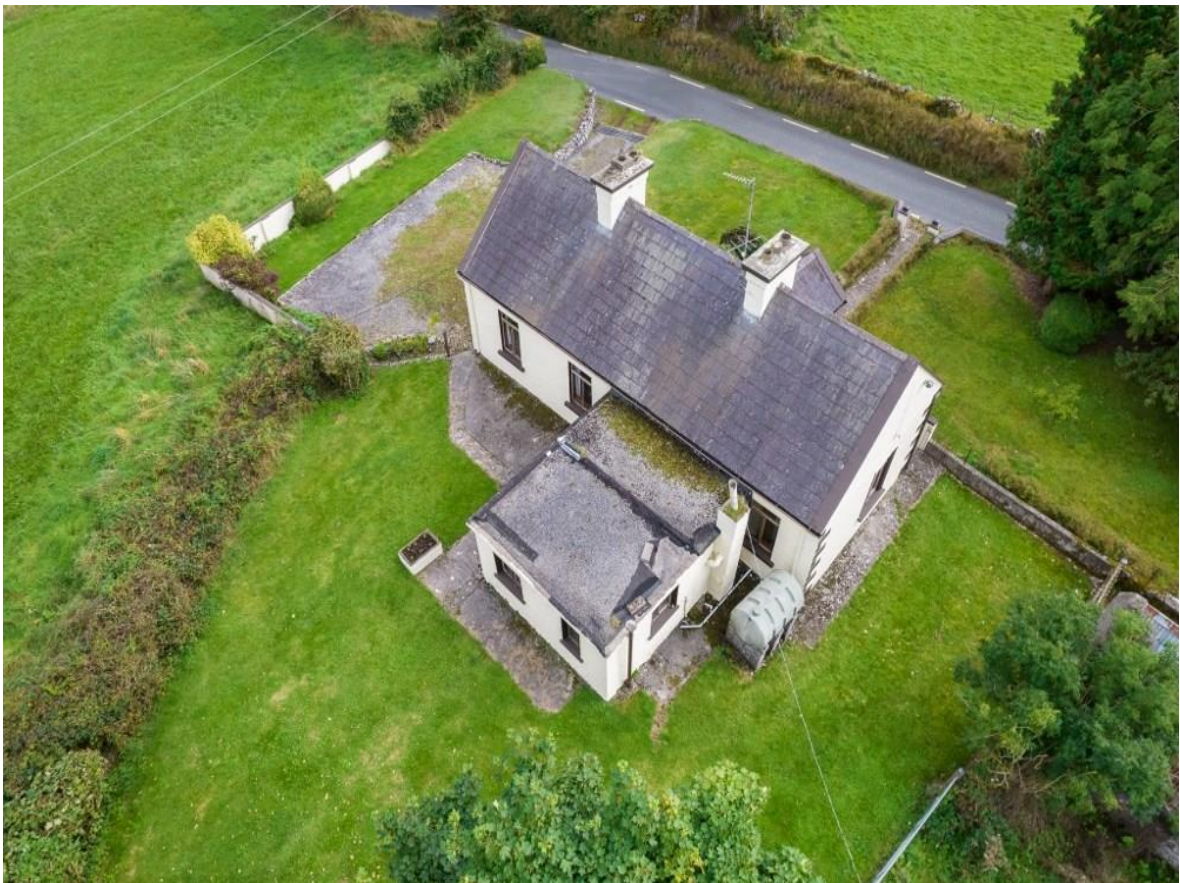
Shannagh Beg, Glenamaddy, Co. Galway. F45 CX99