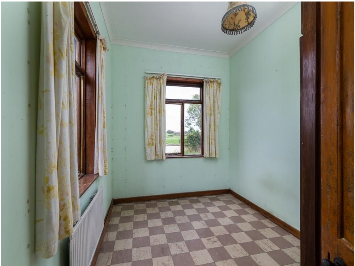
Shannagh Beg, Glenamaddy, Co. Galway. F45 CX99