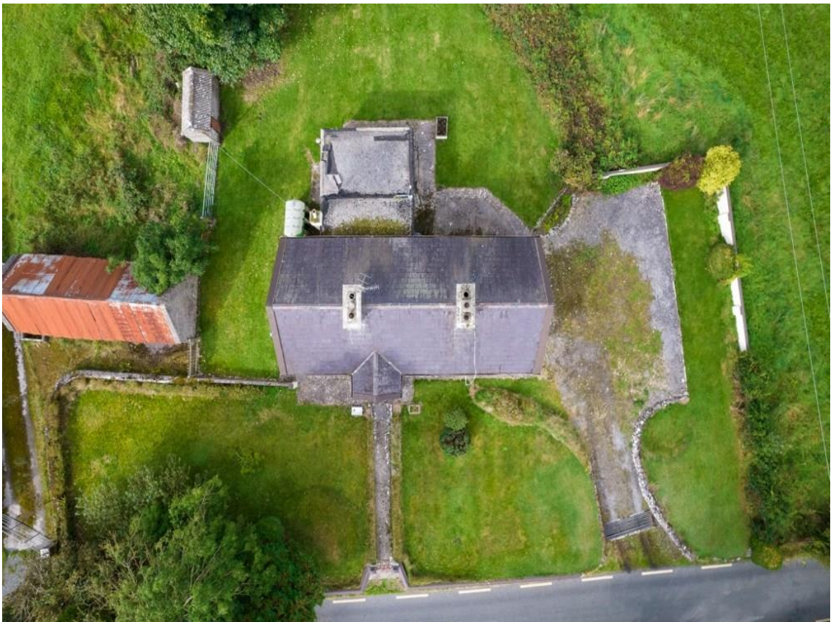
Shannagh Beg, Glenamaddy, Co. Galway. F45 CX99