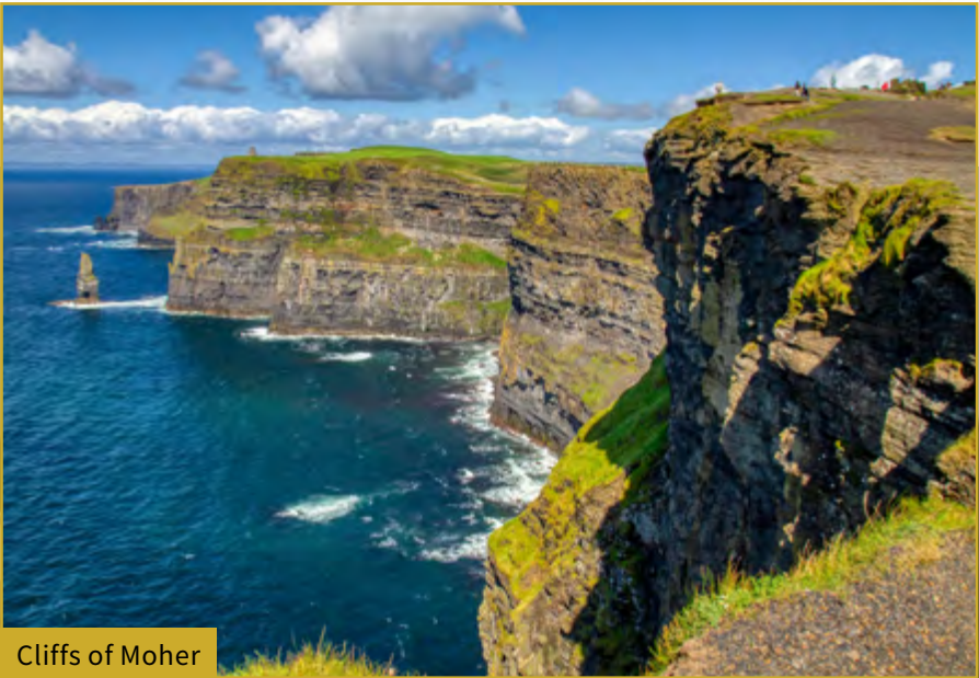
Cliffs of Moher