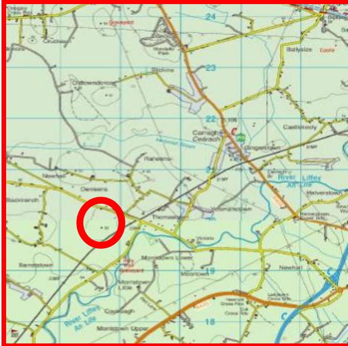
Location of lands in red