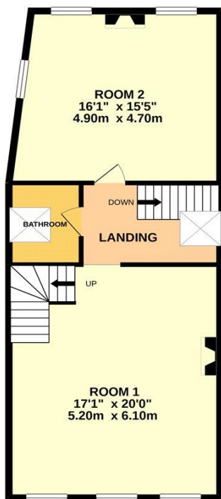
1ST FLOOR 687 sq.ft. (63.9 sq.m.) approx.