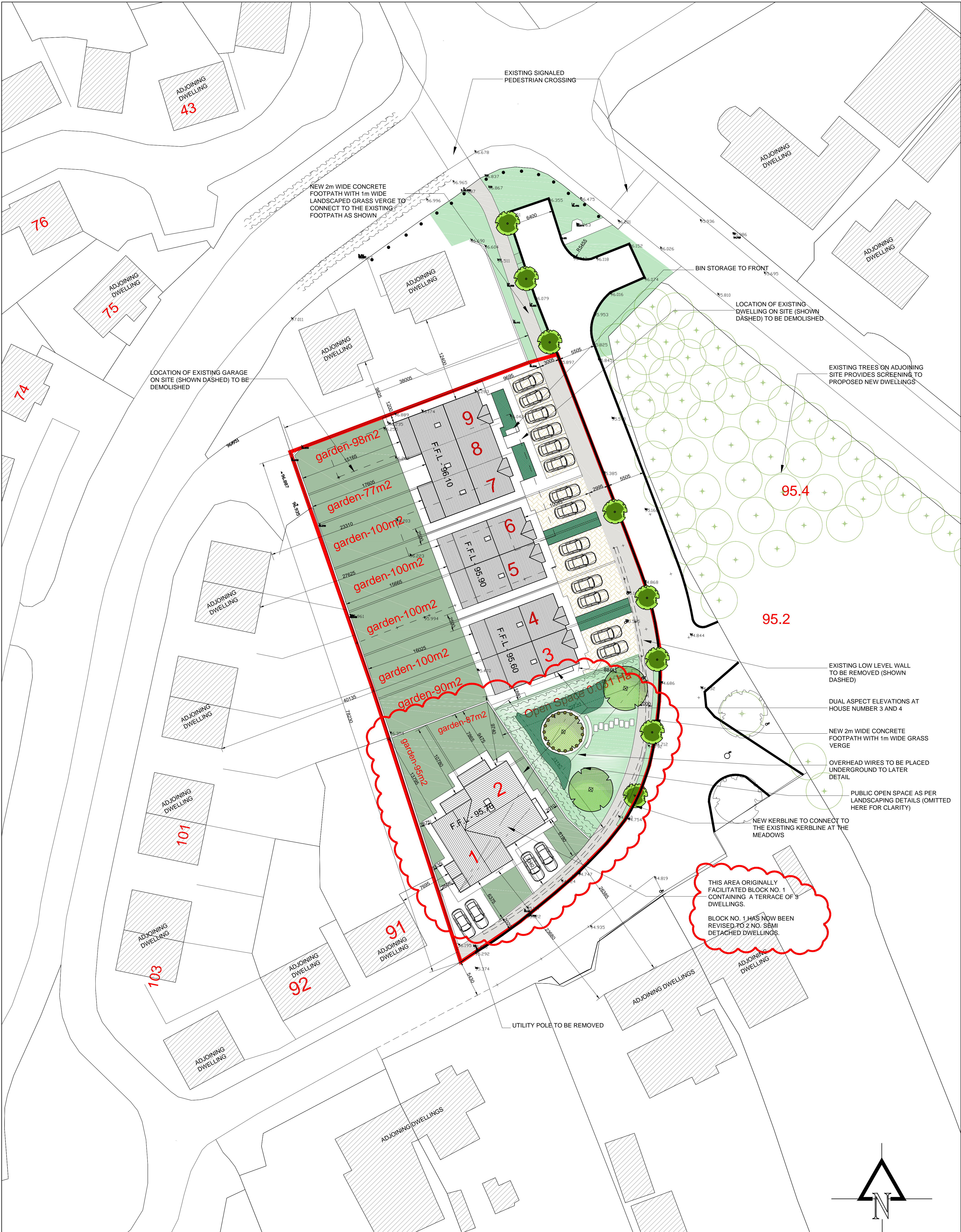
SITE LAYOUT SCALE 1:250