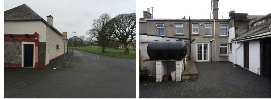
Park opposite pub on corner & enclosed yard with numerous out buildings