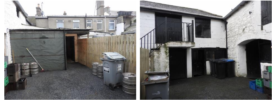
Smoking Area off the Bar & some of the outbuildings with store room off lounge