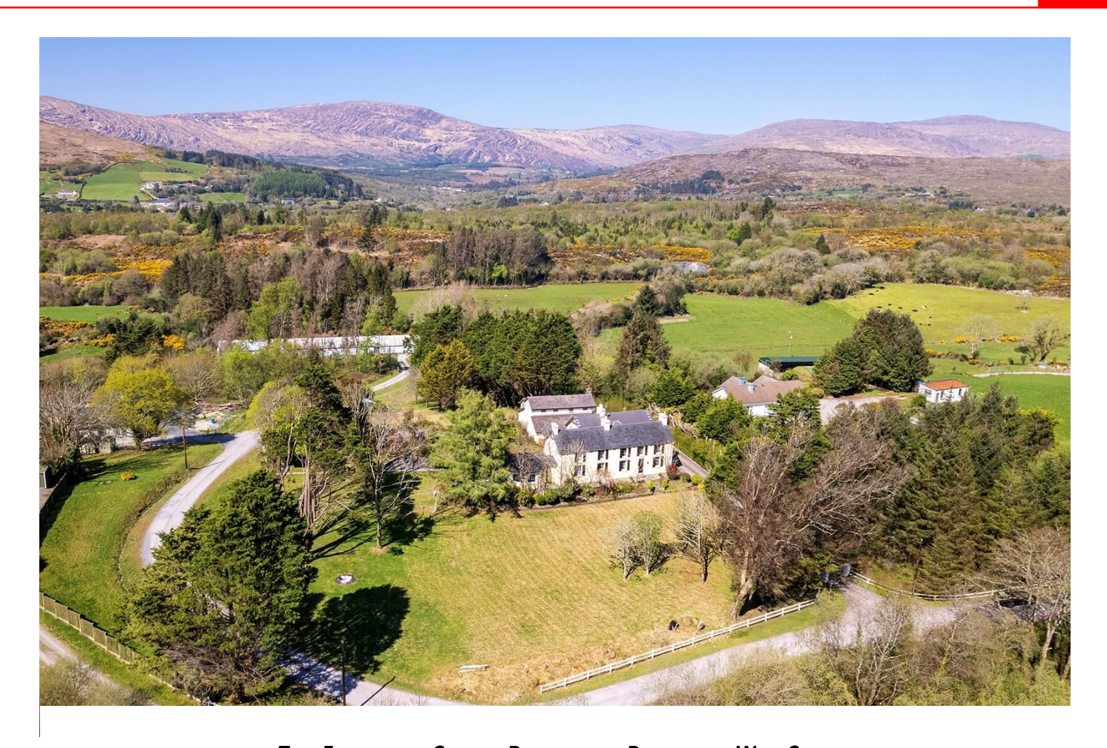
TWO EXCEPTIONAL COASTAL RESIDENCES IN BALLYLICKEY, WEST CORK

Exceptional Residence and guest cottage on 3.5 acres approx., of mature landscaped gardens, located at Ballylickey, just 3 miles from the vibrant harbour town of Bantry and 5 miles from the picturesque village of Glengarriff. Two Trees and The Barn offer an exceptional opportunity to experience timeless charm and modern comfort in a spectacular natural setting.