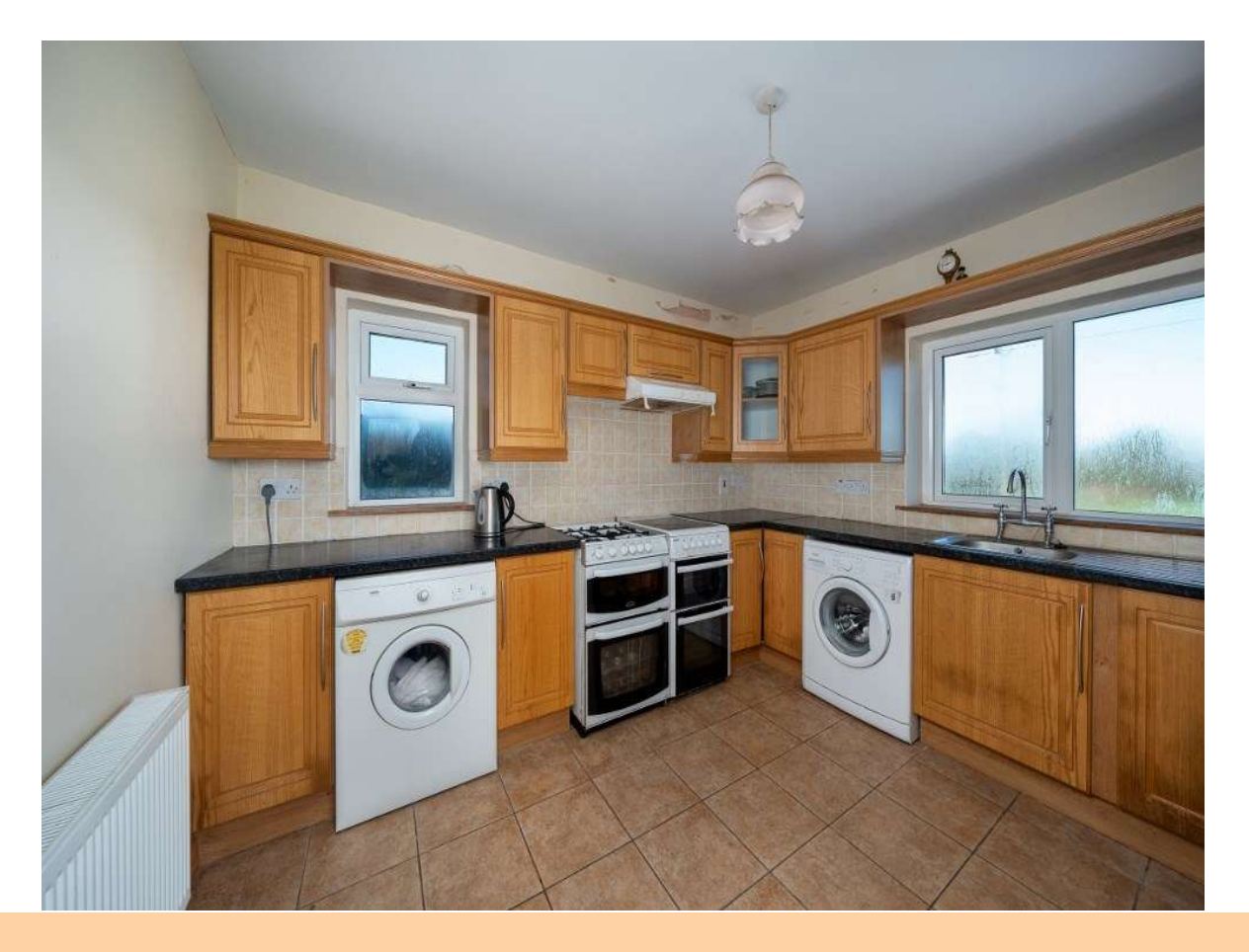
Residence on c. 5.25 Acres, Shannagh More, Glenamaddy, Co. Galway. F45 KH67