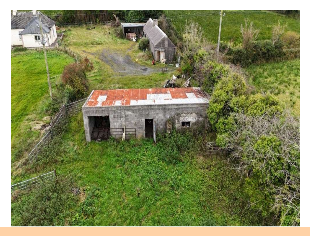
Residence on c. 5.25 Acres, Shannagh More, Glenamaddy, Co. Galway. F45 KH67