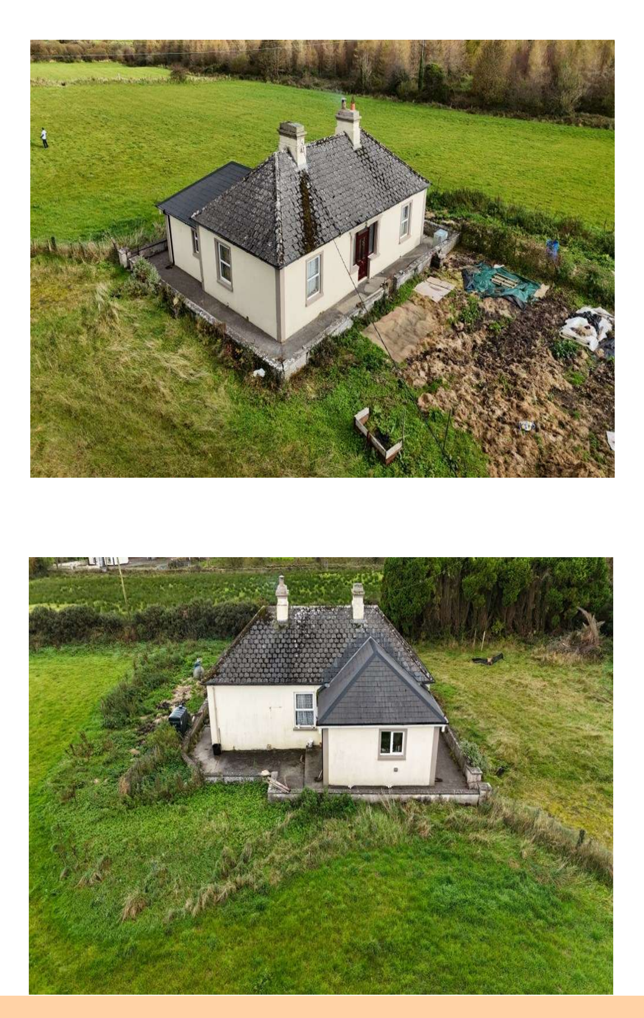
Residence on c. 5.25 Acres, Shannagh More, Glenamaddy, Co. Galway. F45 KH67