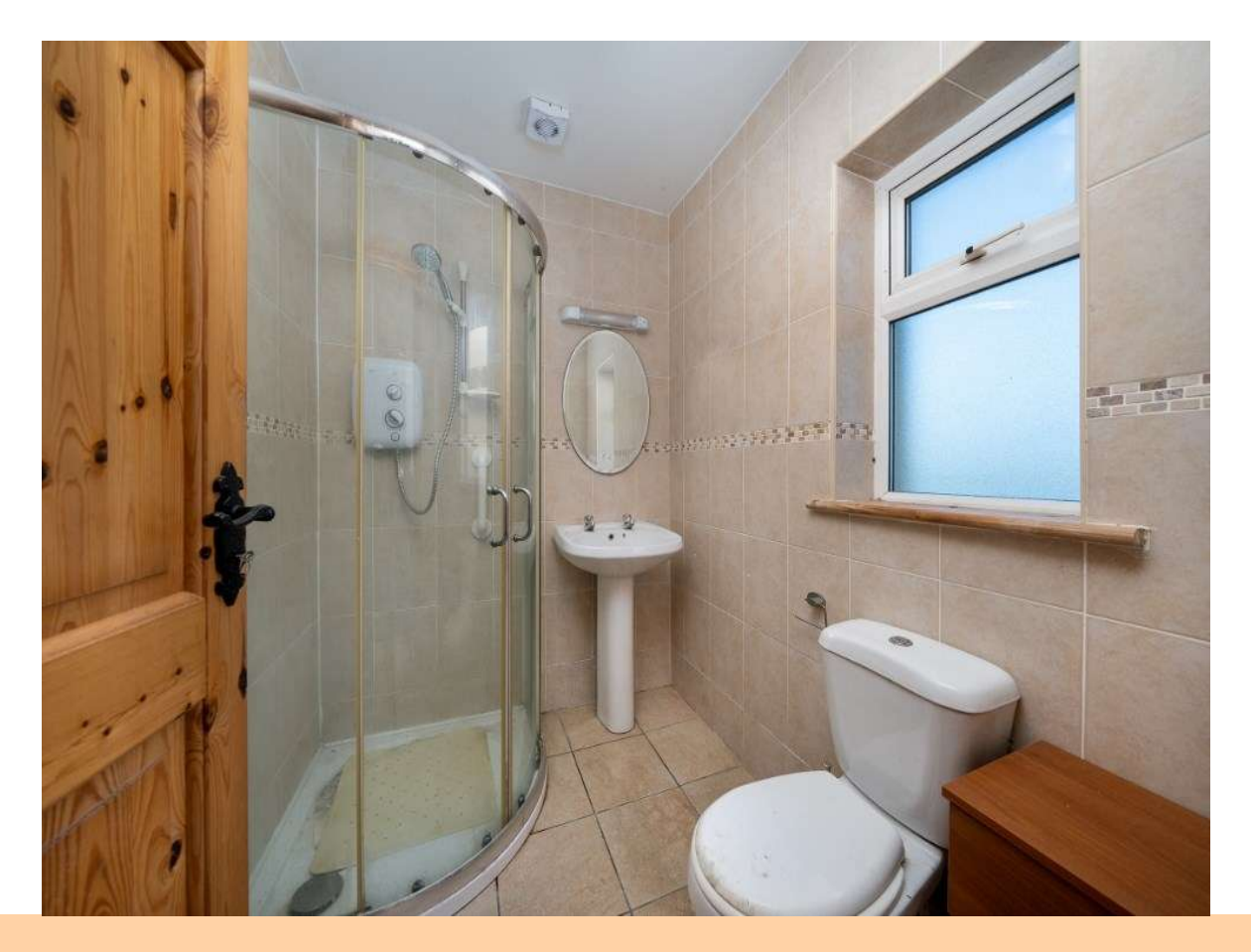
Residence on c. 5.25 Acres, Shannagh More, Glenamaddy, Co. Galway. F45 KH67