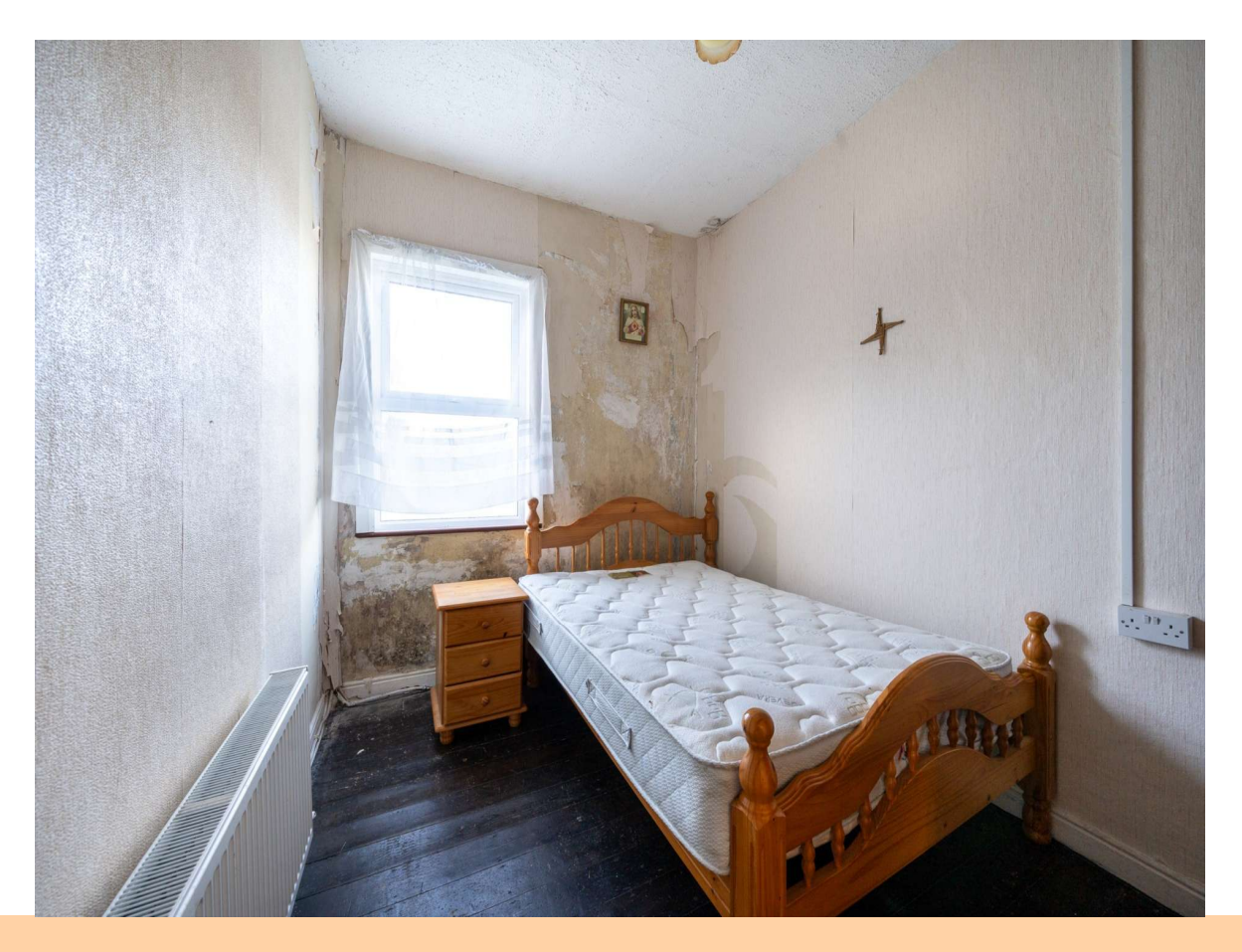
Residence on c. 5.25 Acres, Shannagh More, Glenamaddy, Co. Galway. F45 KH67