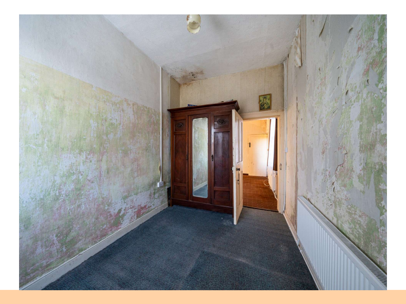
Residence on c. 5.25 Acres, Shannagh More, Glenamaddy, Co. Galway. F45 KH67