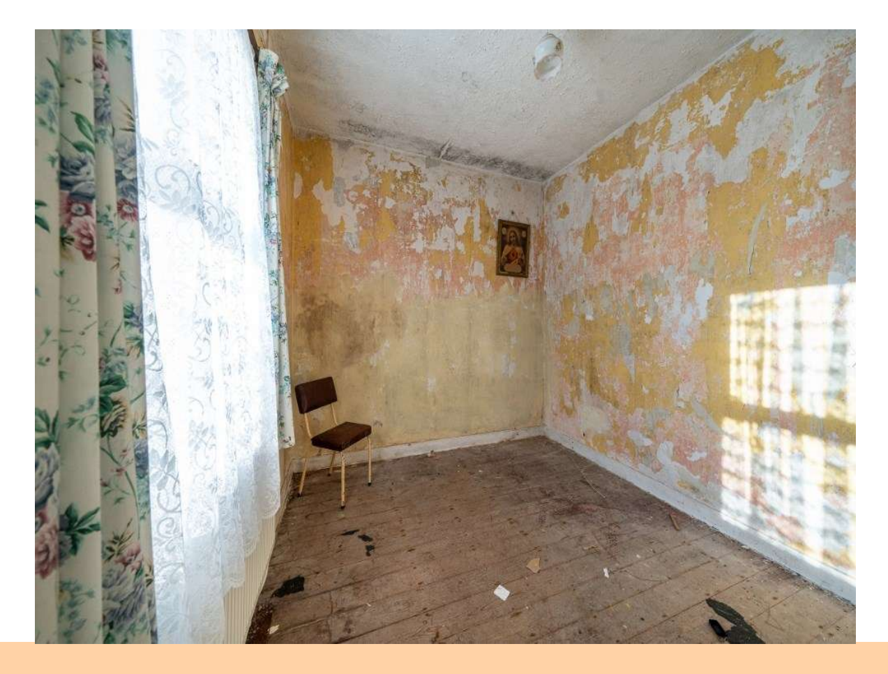
Residence on c. 5.25 Acres, Shannagh More, Glenamaddy, Co. Galway. F45 KH67