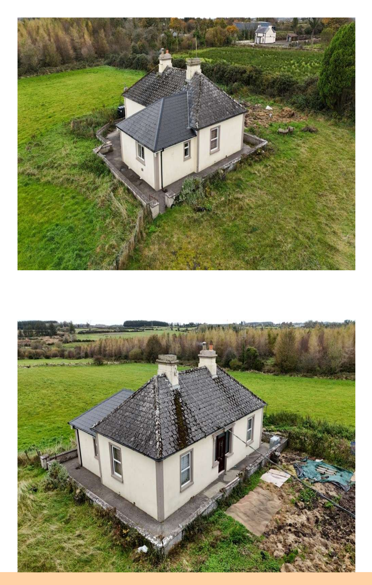
Residence on c. 5.25 Acres, Shannagh More, Glenamaddy, Co. Galway. F45 KH67