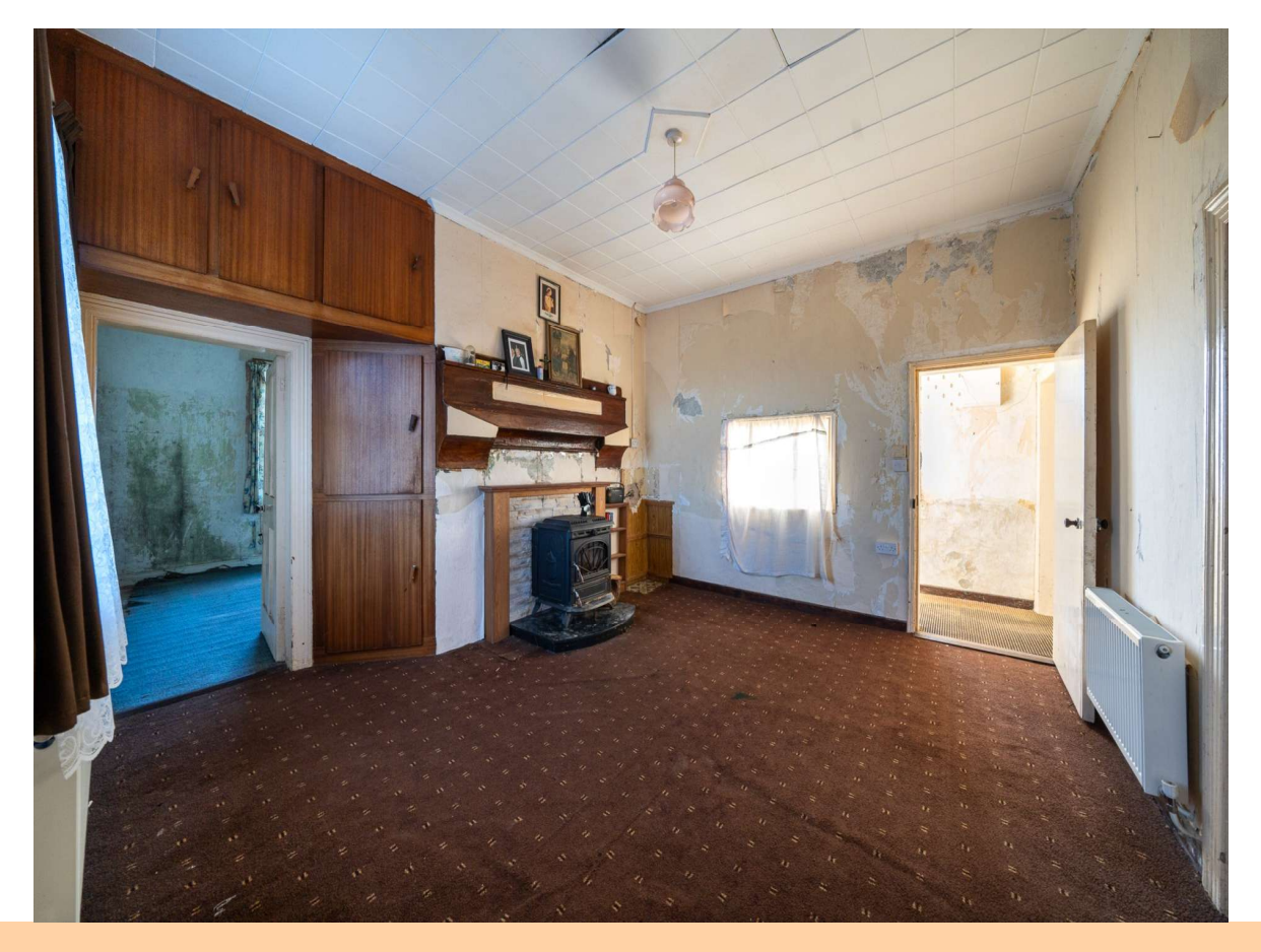
Residence on c. 5.25 Acres, Shannagh More, Glenamaddy, Co. Galway. F45 KH67