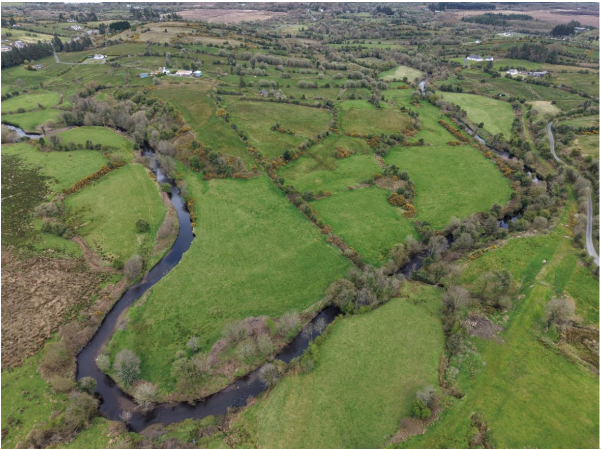
Derelict Residence & Farm Buildings C. 41.44 Acres, Corgorman, Arigna, County Roscommon