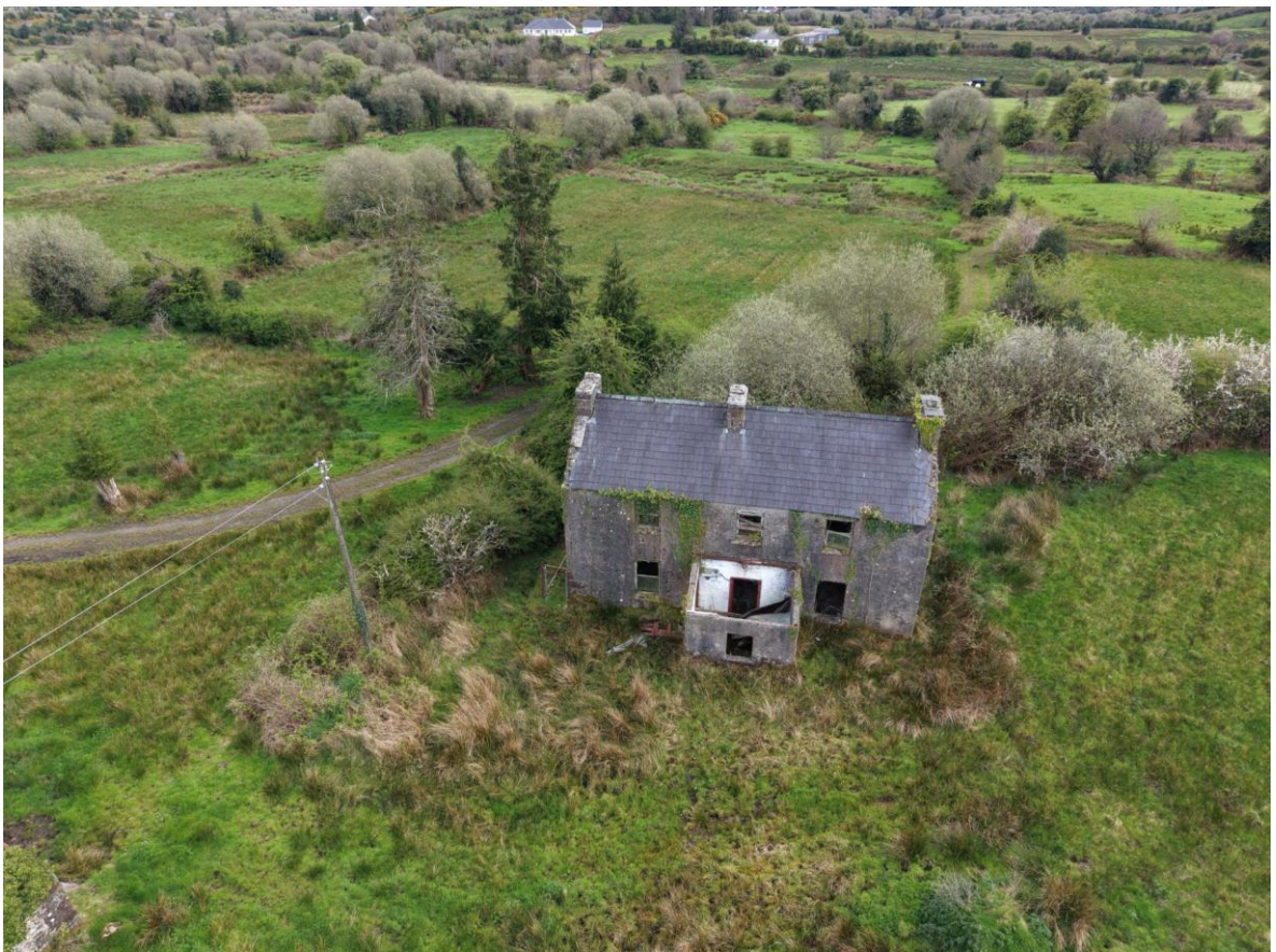
Derelict Residence & Farm Buildings c. 41.44 Acres, Arigna, Co. Roscommon.