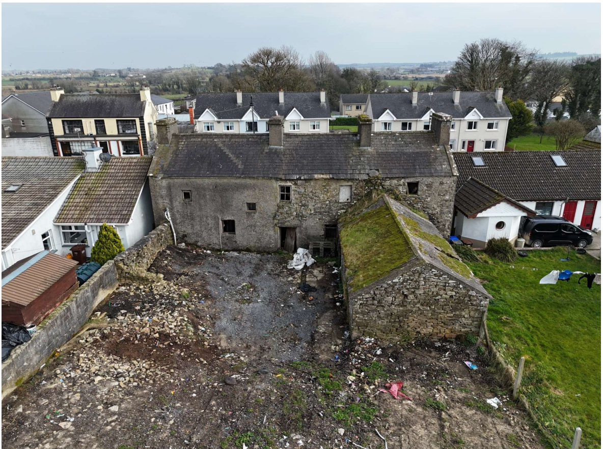
Residence On C. 0.60 Acres, Ballinagare Village, F45 DK02