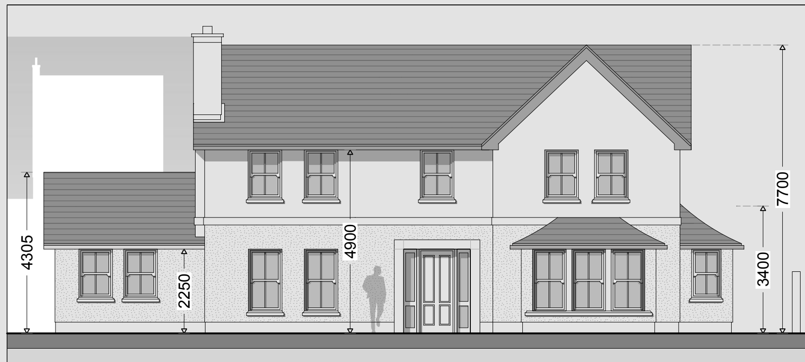
Front Elevation - East