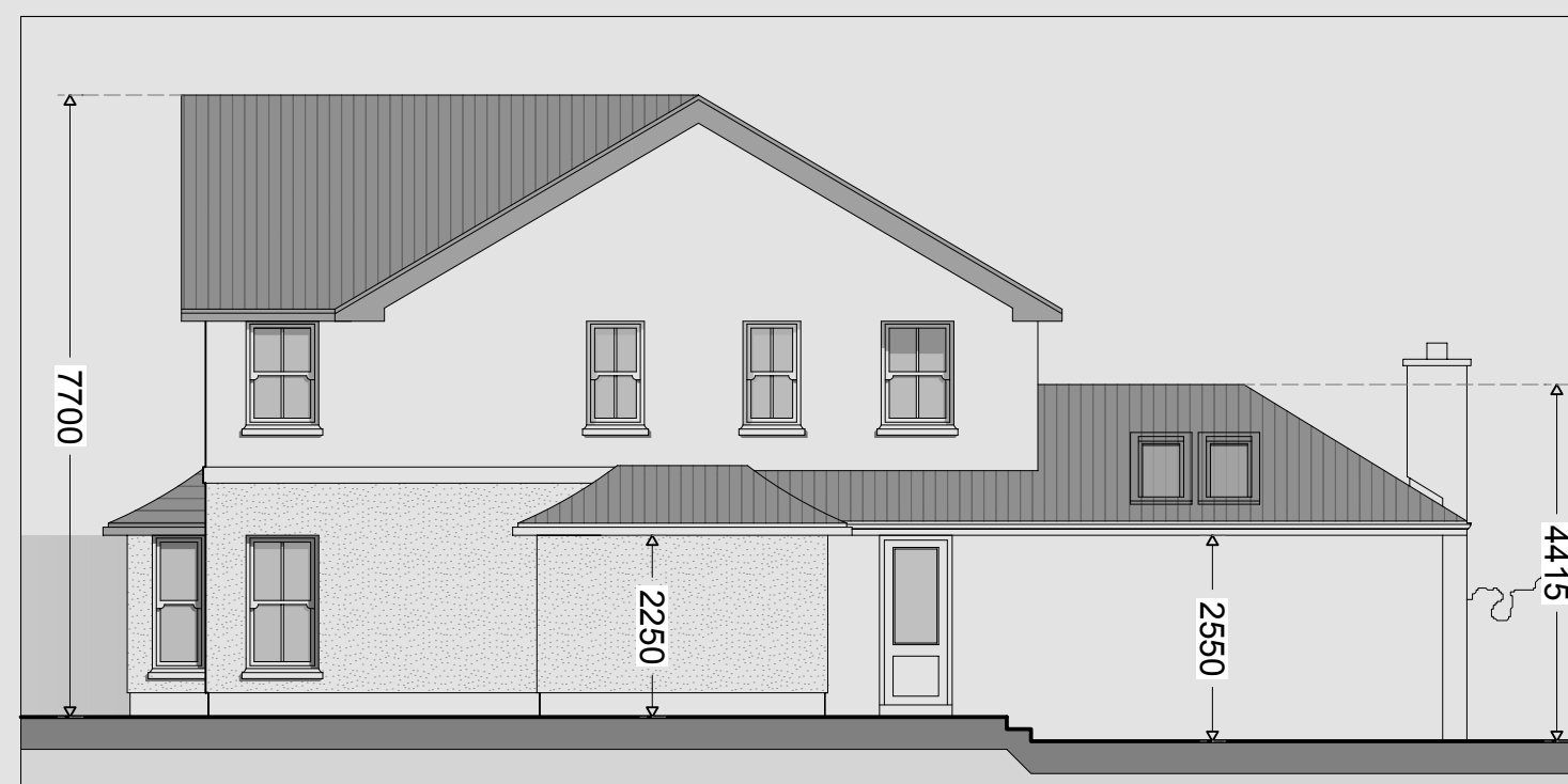
Side Elevation - North