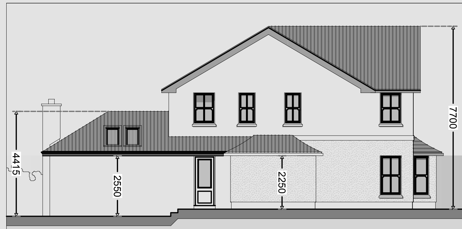
Side Elevation - East

plaster painted render finish plaster painted plinth