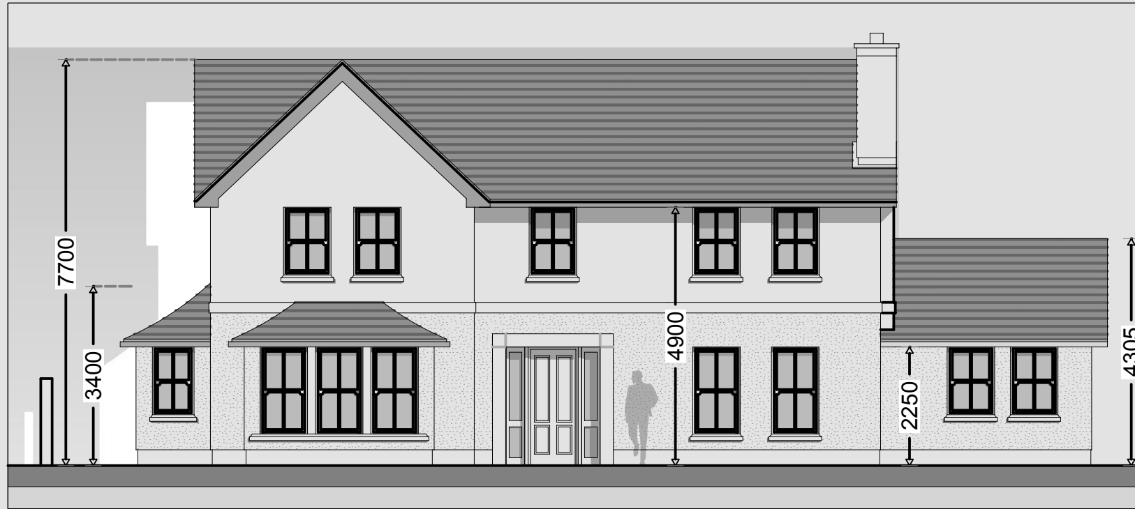
Front Elevation - North