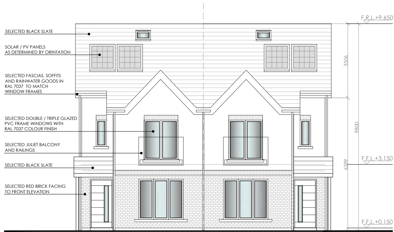
PROPOSED TYPICAL FRONT ELEVATION - SCALE 1:100

GROUND FLOOR = 65.6 sqm FIRST FLOOR = 52.6 sqm TOTAL AREA = 118.2 sqm