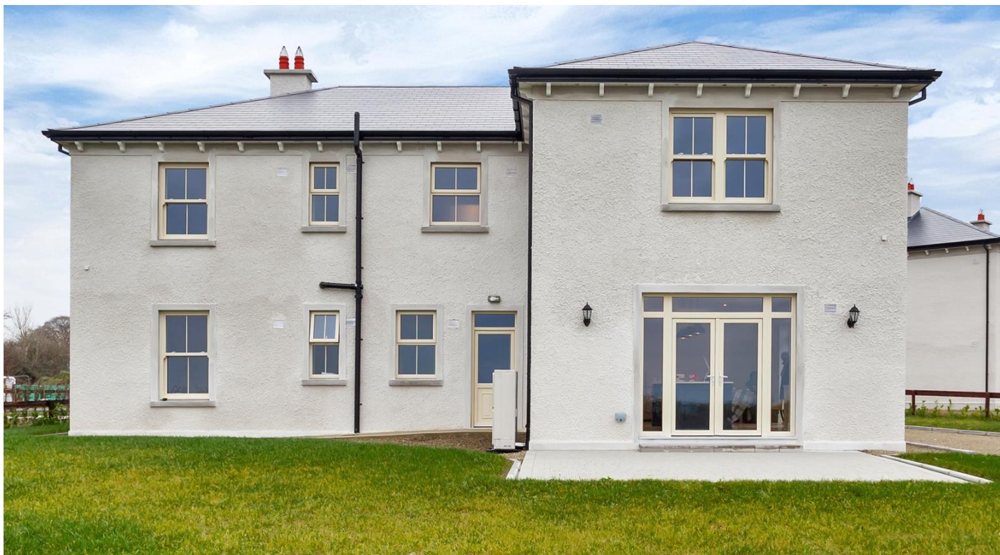
Example of Rear French Doors & Patio Area