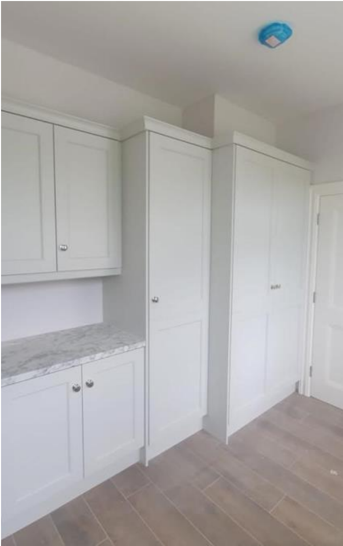
Example of Utility Room