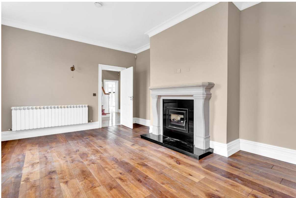
Belvedere Stone Fireplace