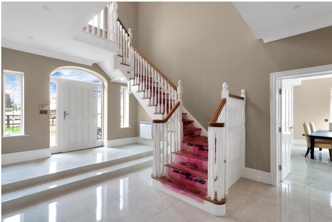
Example of the Staircase