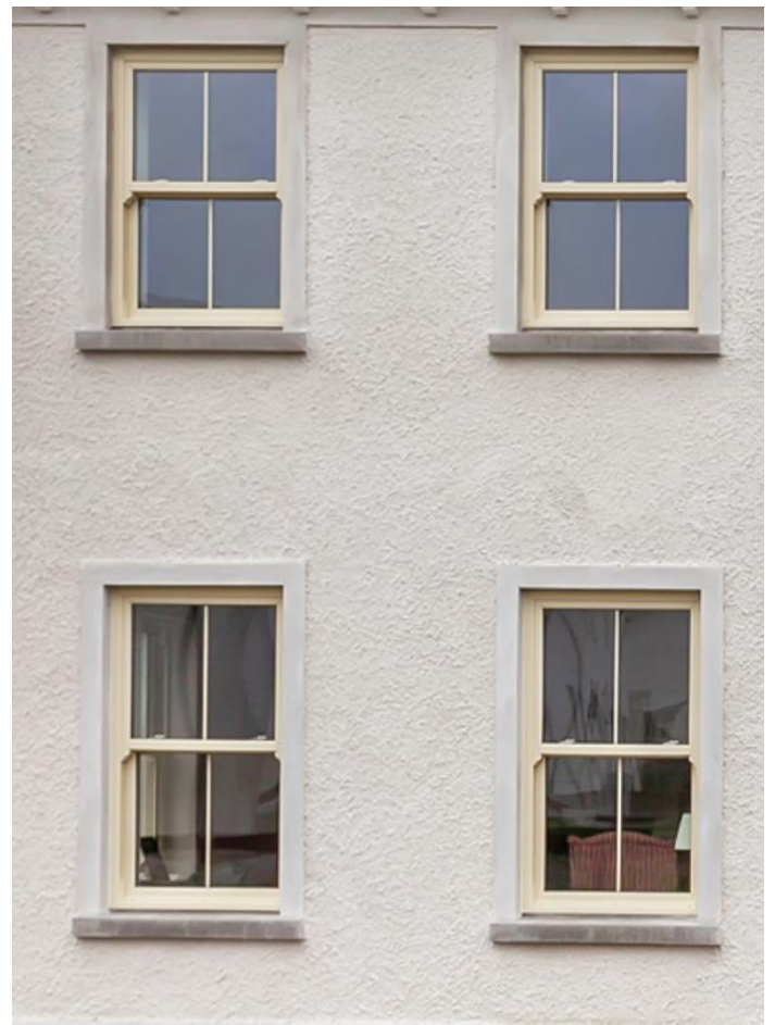
Example of Windows