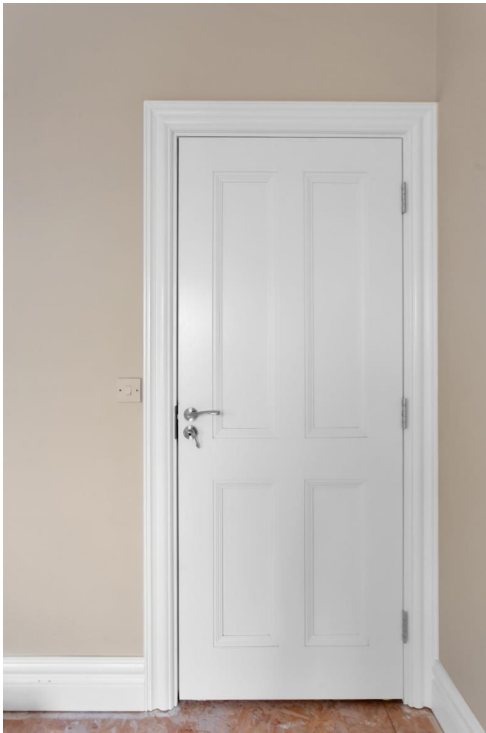
Example of Door & Architrave