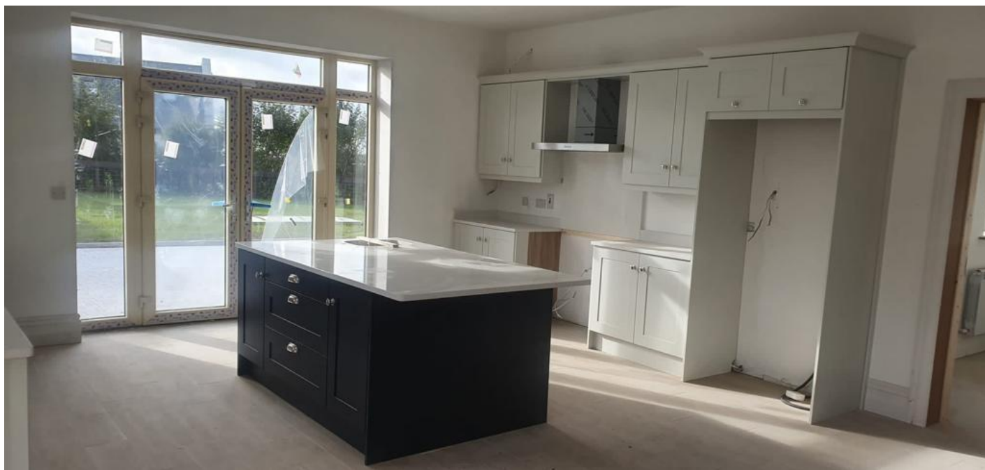
Example of Standard Kitchen