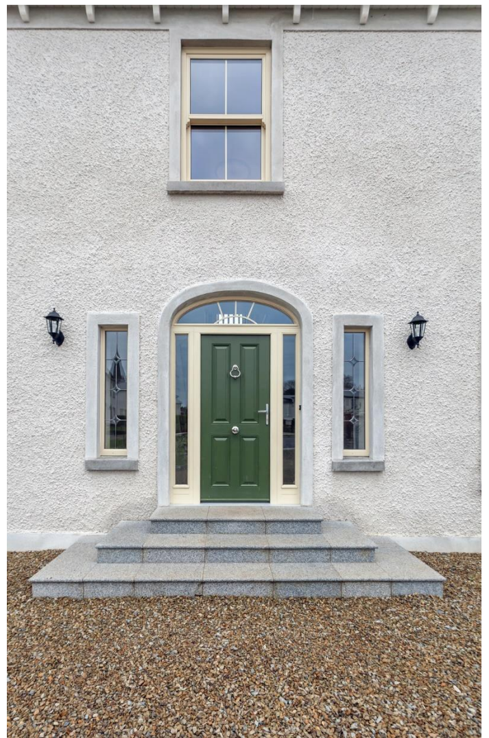
Example of Front Door