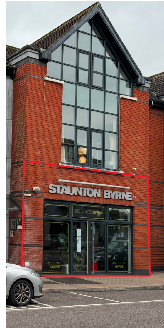
Unit 2, Holbar House, East Douglas Village, Cork

The unit extends to approx. 72 sq.m (775 sq.ft)