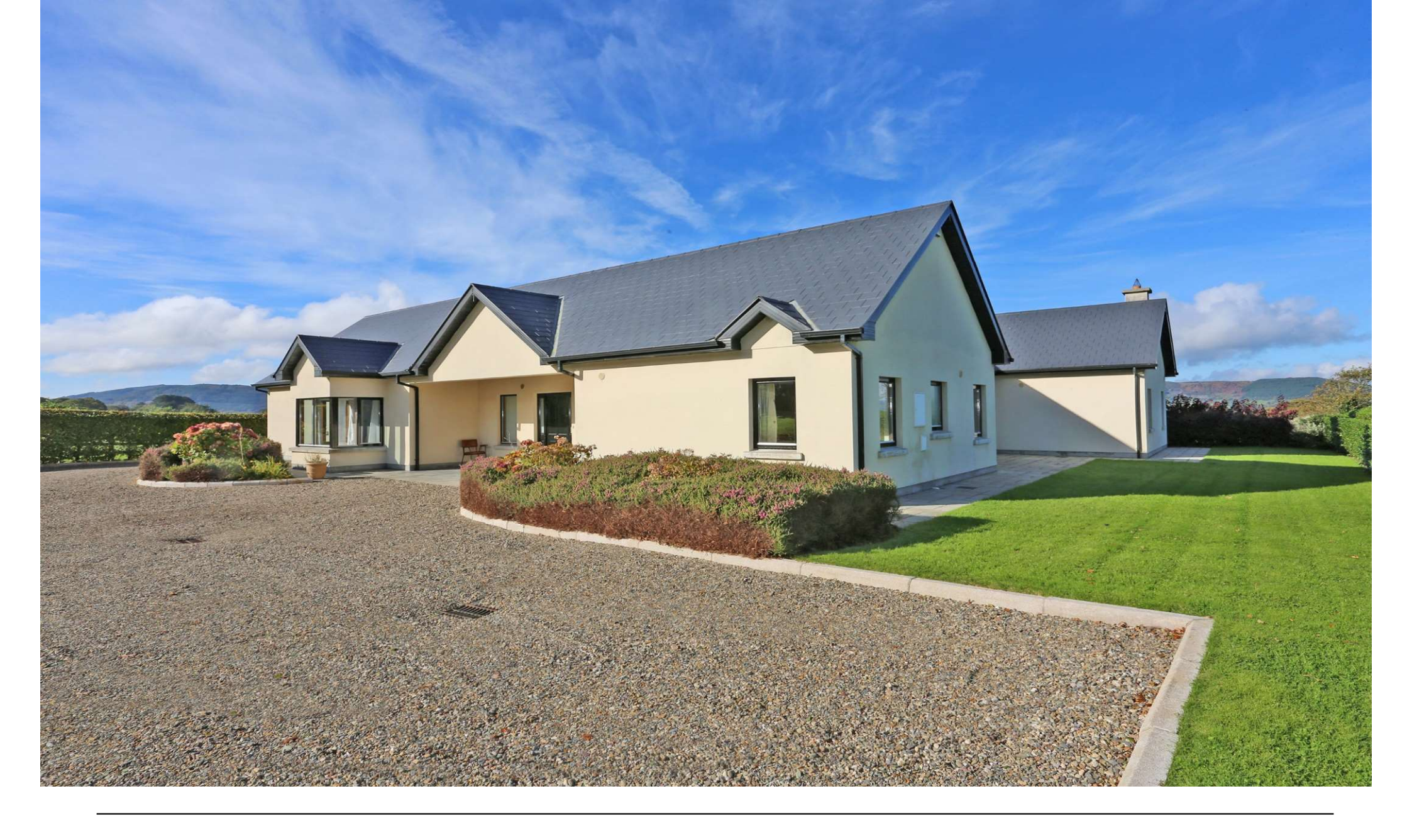
Beautifully presented meticulously maintained contemporary style bungalow residence on the eastern shores of Lough Derg with access to the lake shore.