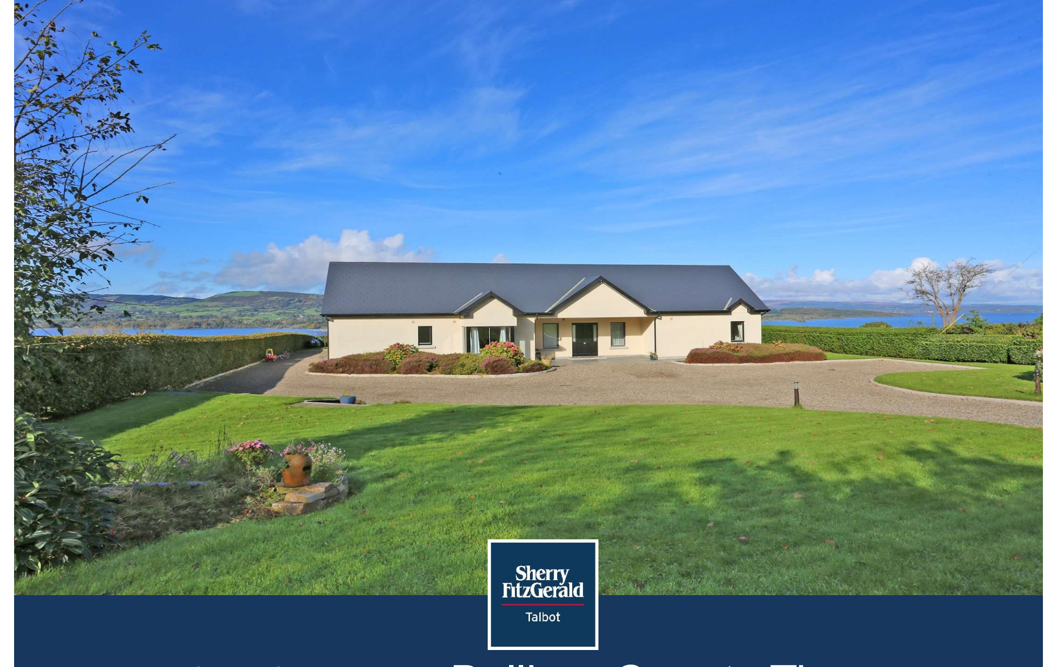
Townlough Upper, Ballina, County Tipperary V94 F98D.